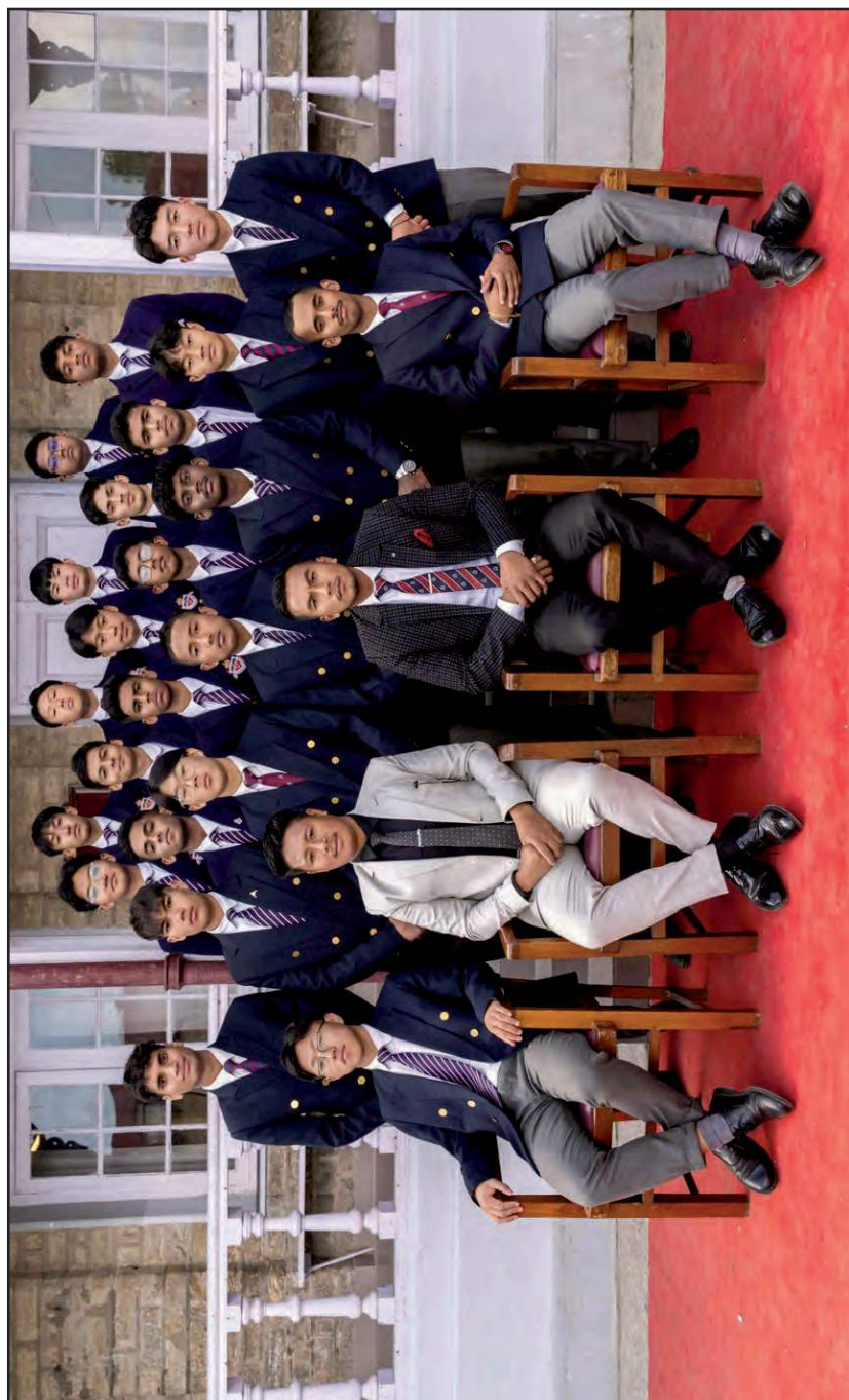
The ISC Football Team