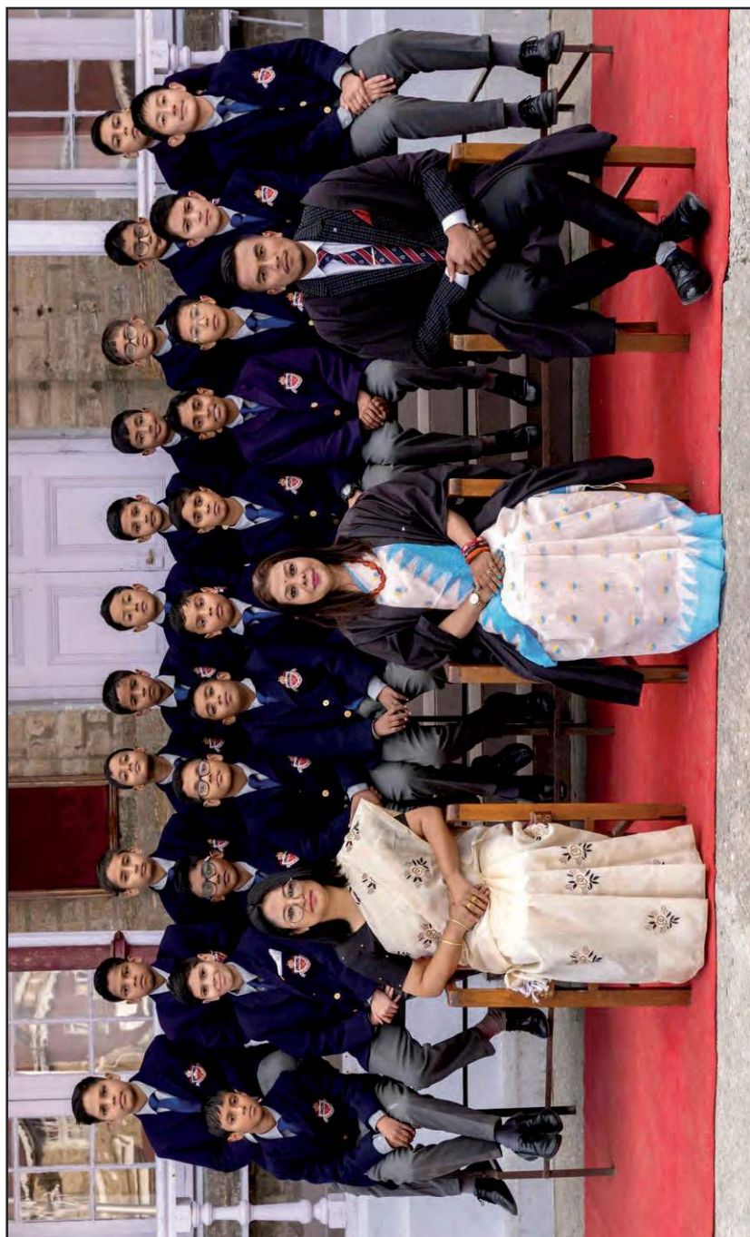
The Tenzing House