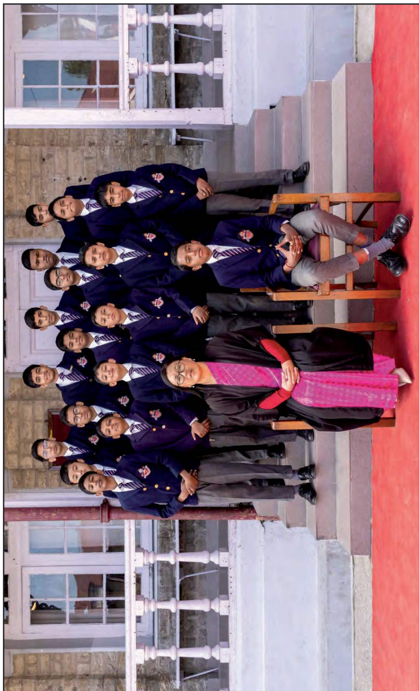
The Junior Wing Quiz Team