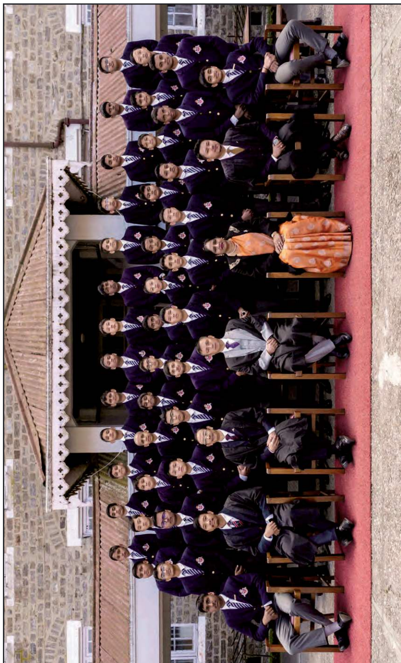
The Westcott House