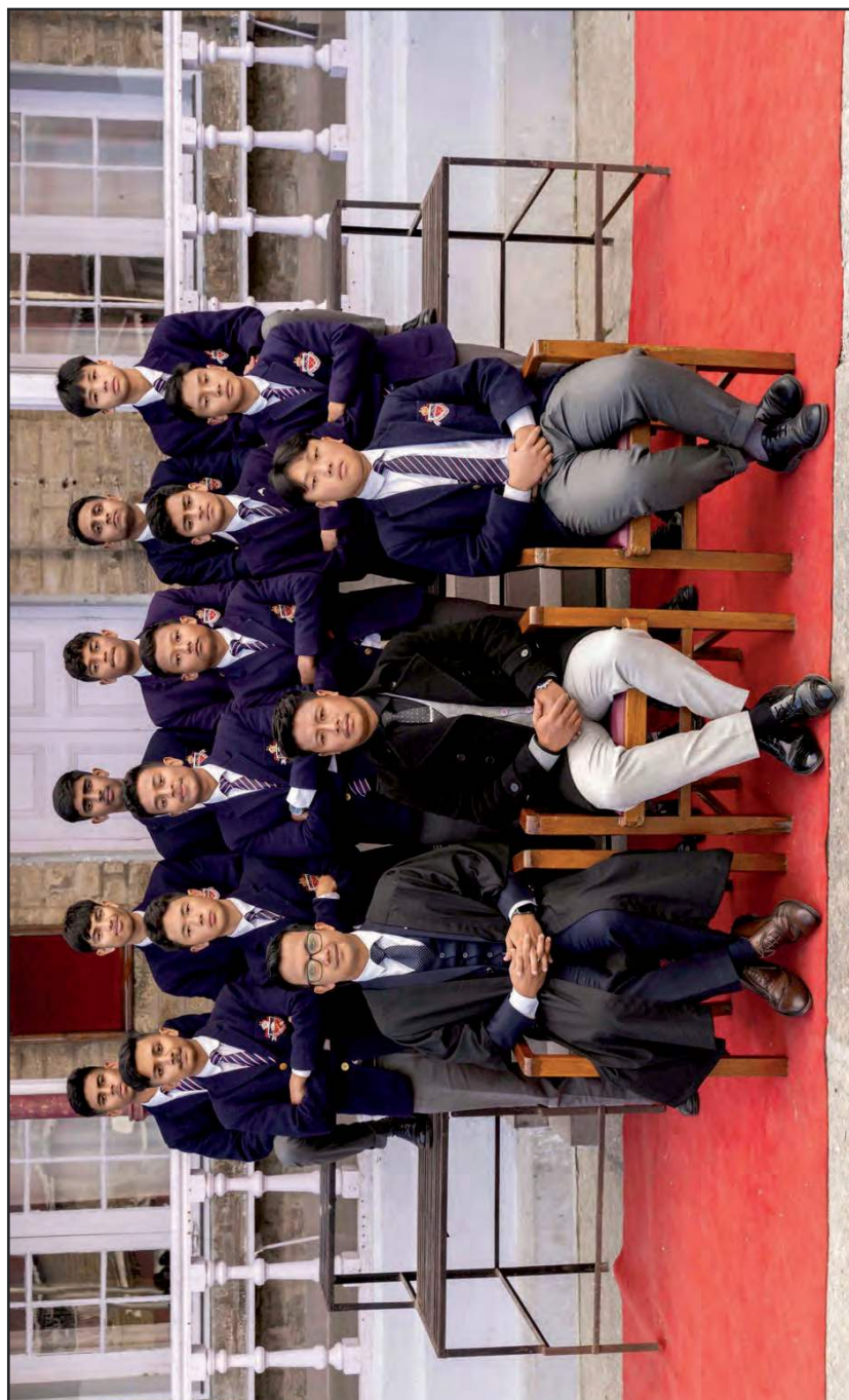
The Under 10 Basketball Team