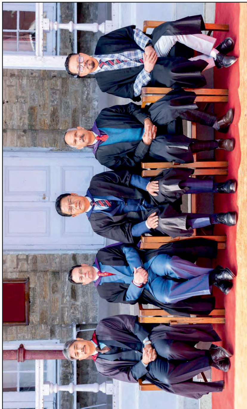
The School Coordinators