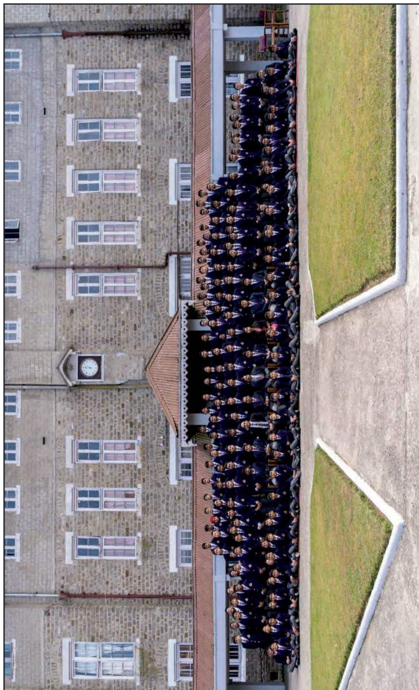
The Hindi Parishad