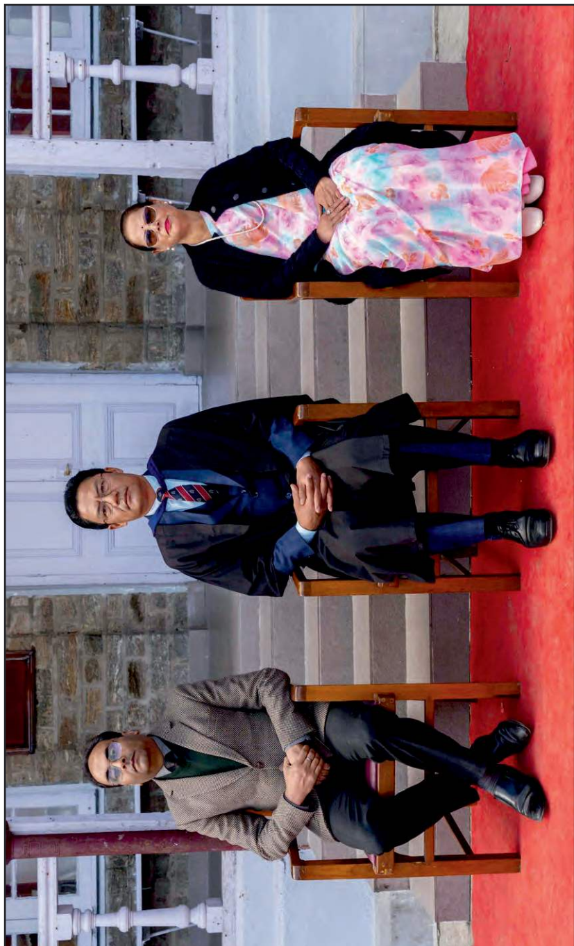
The Staff Completing 25 Years of Service