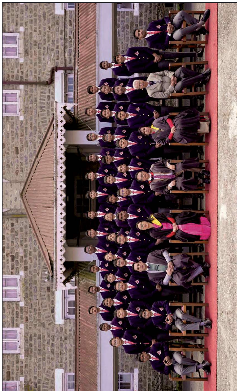
The Anderson House