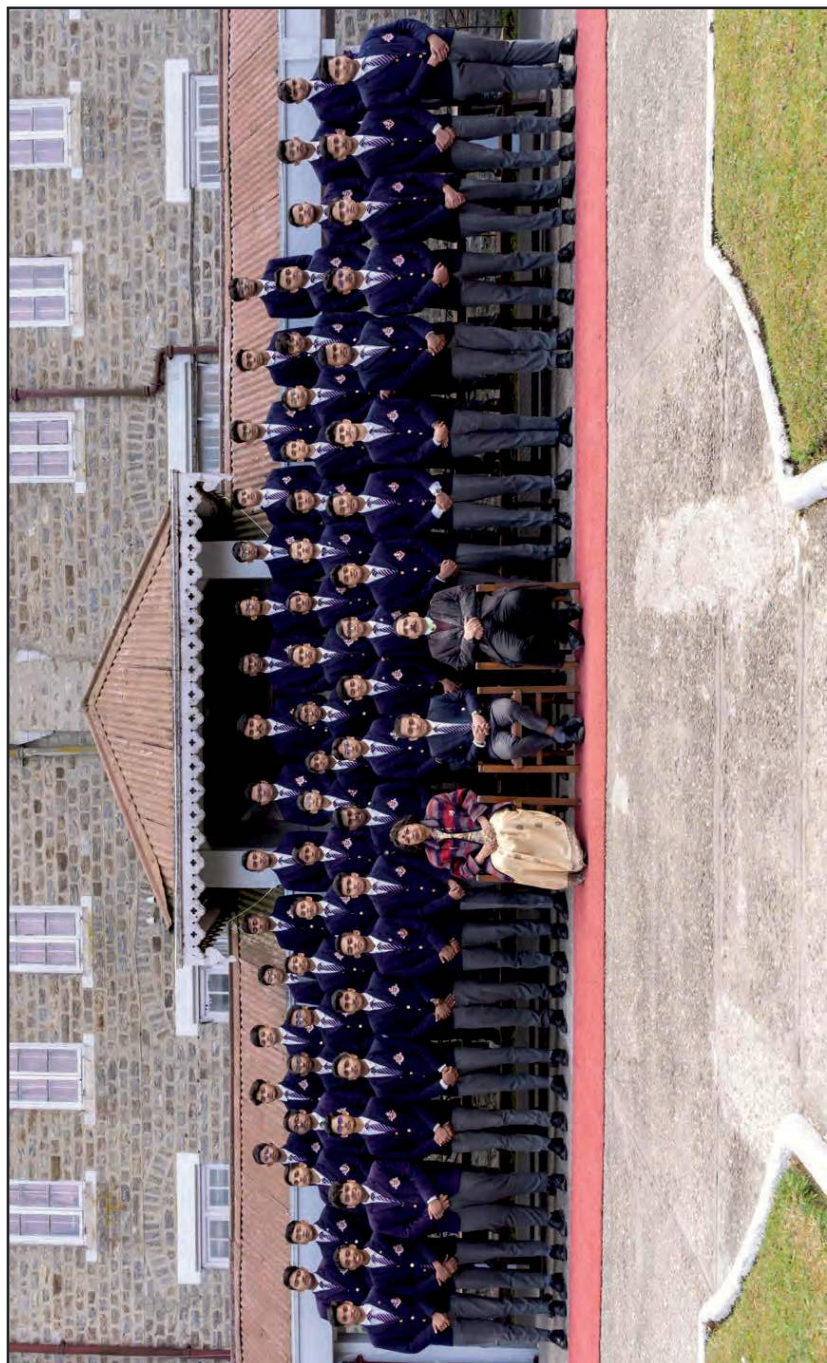
The Bengali Society