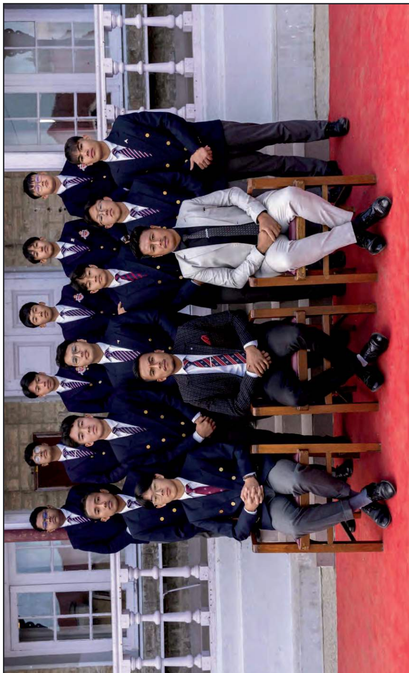
The ISC Volleyball Team