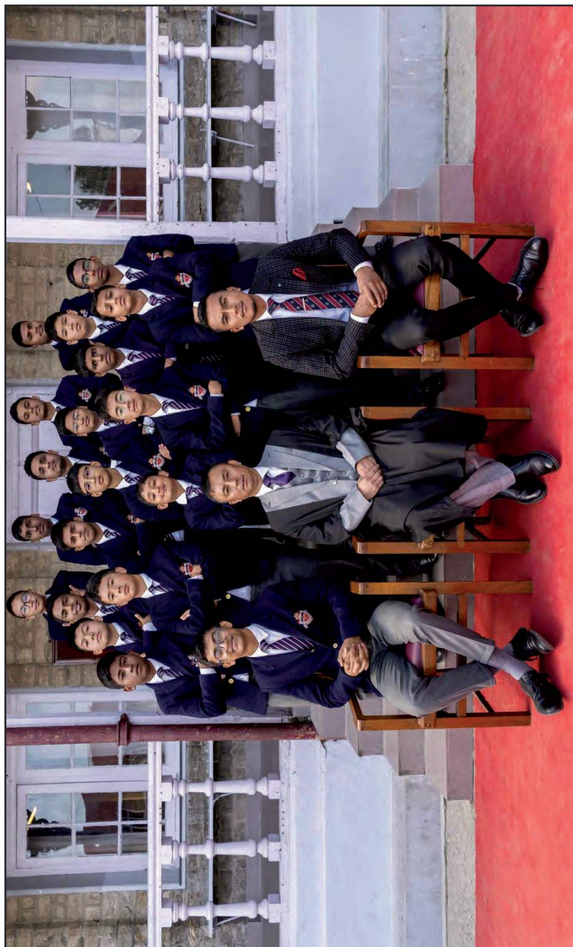
The Junior Wing Football Team