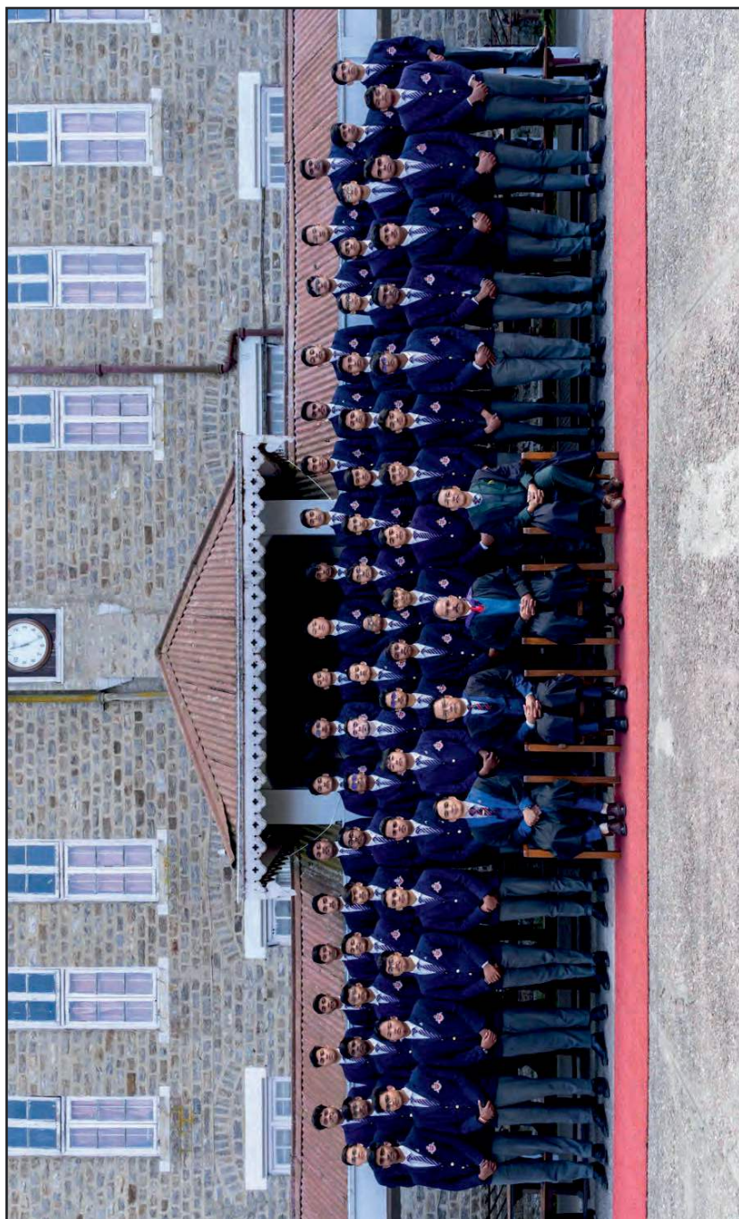
The ICSE Batch 2024