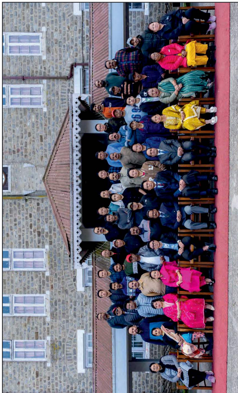
The Support Staff