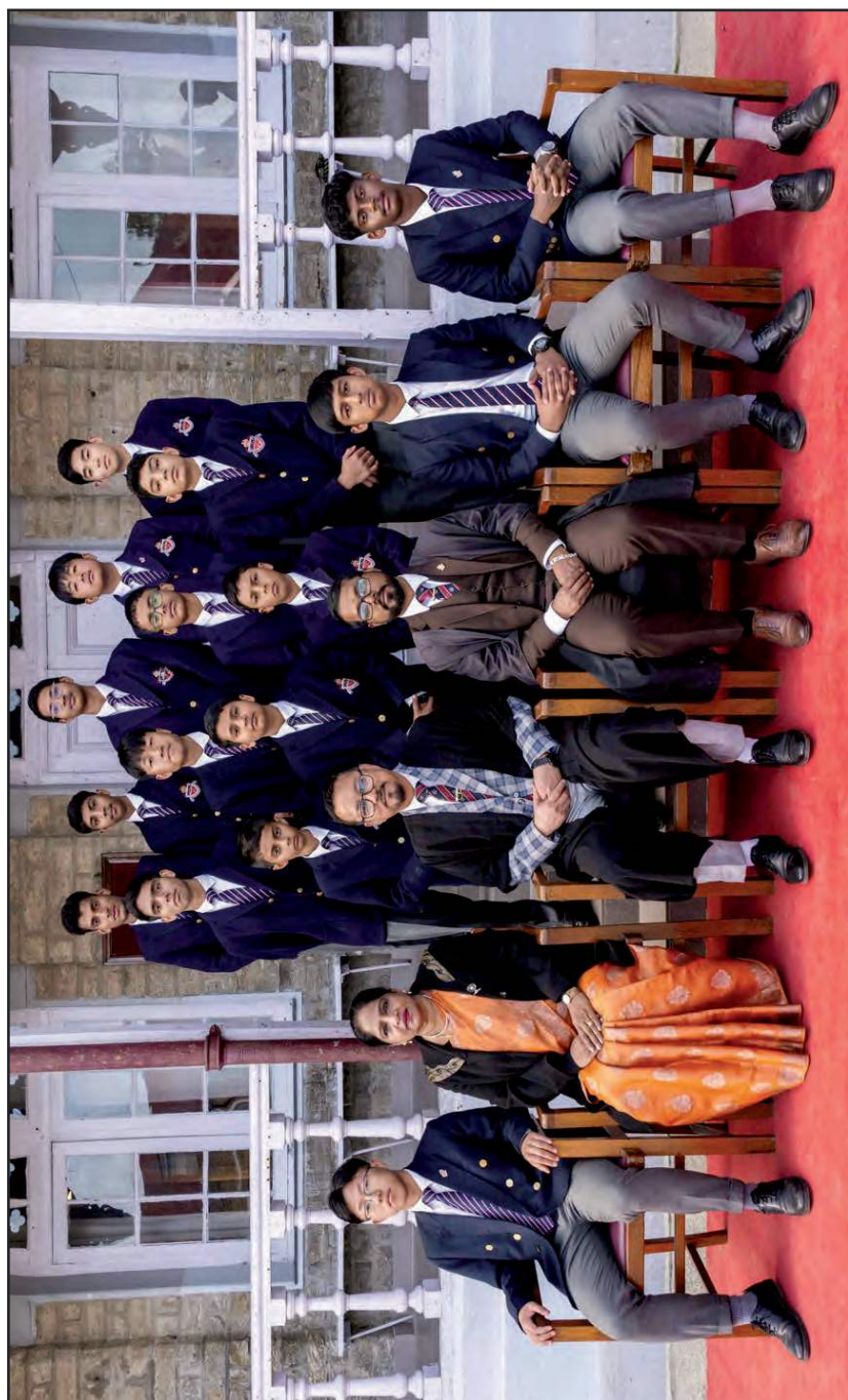
The School Chess Team