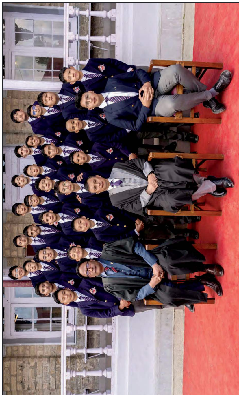
The Nepali Society