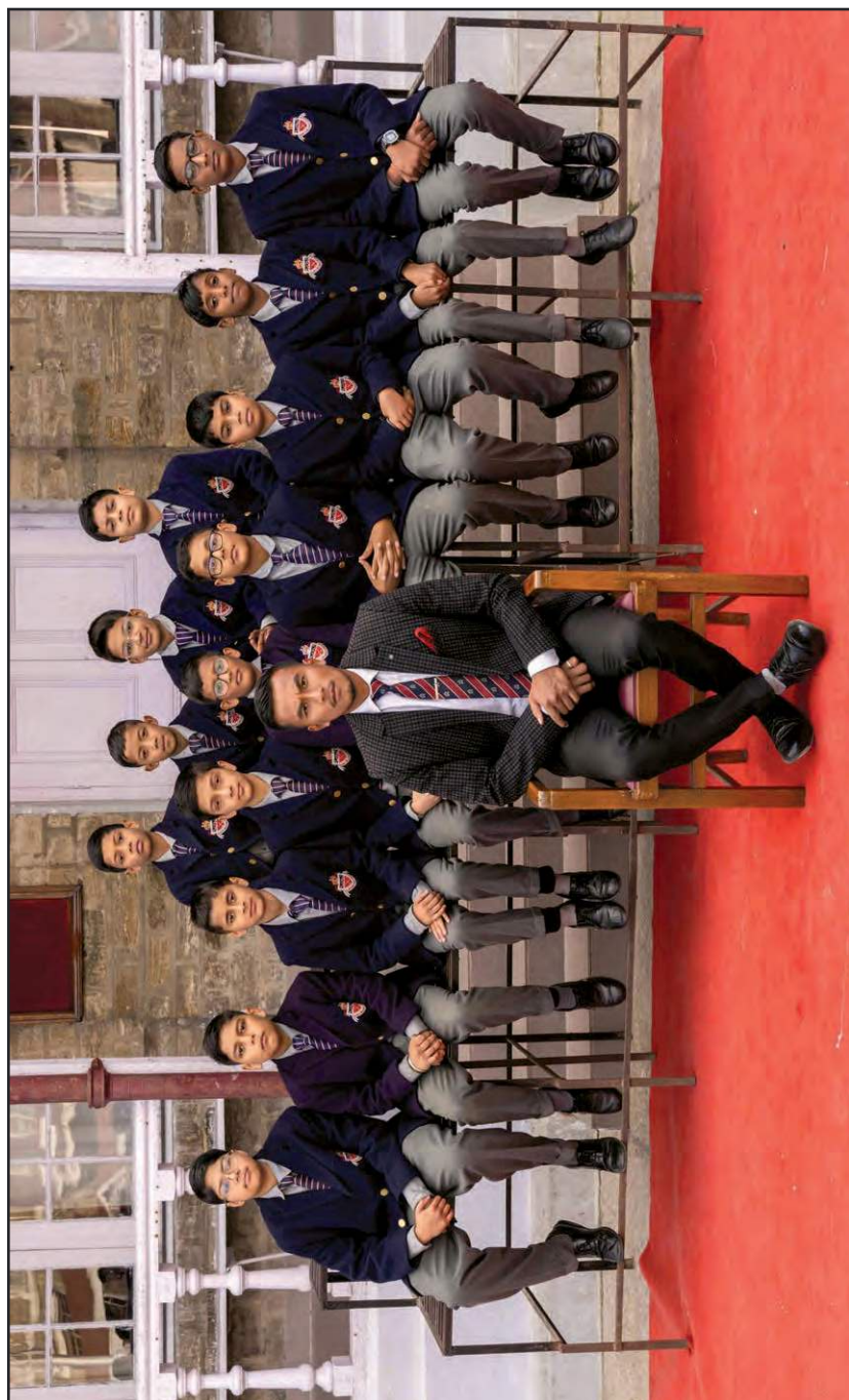
The Primary Wing Cricket Team