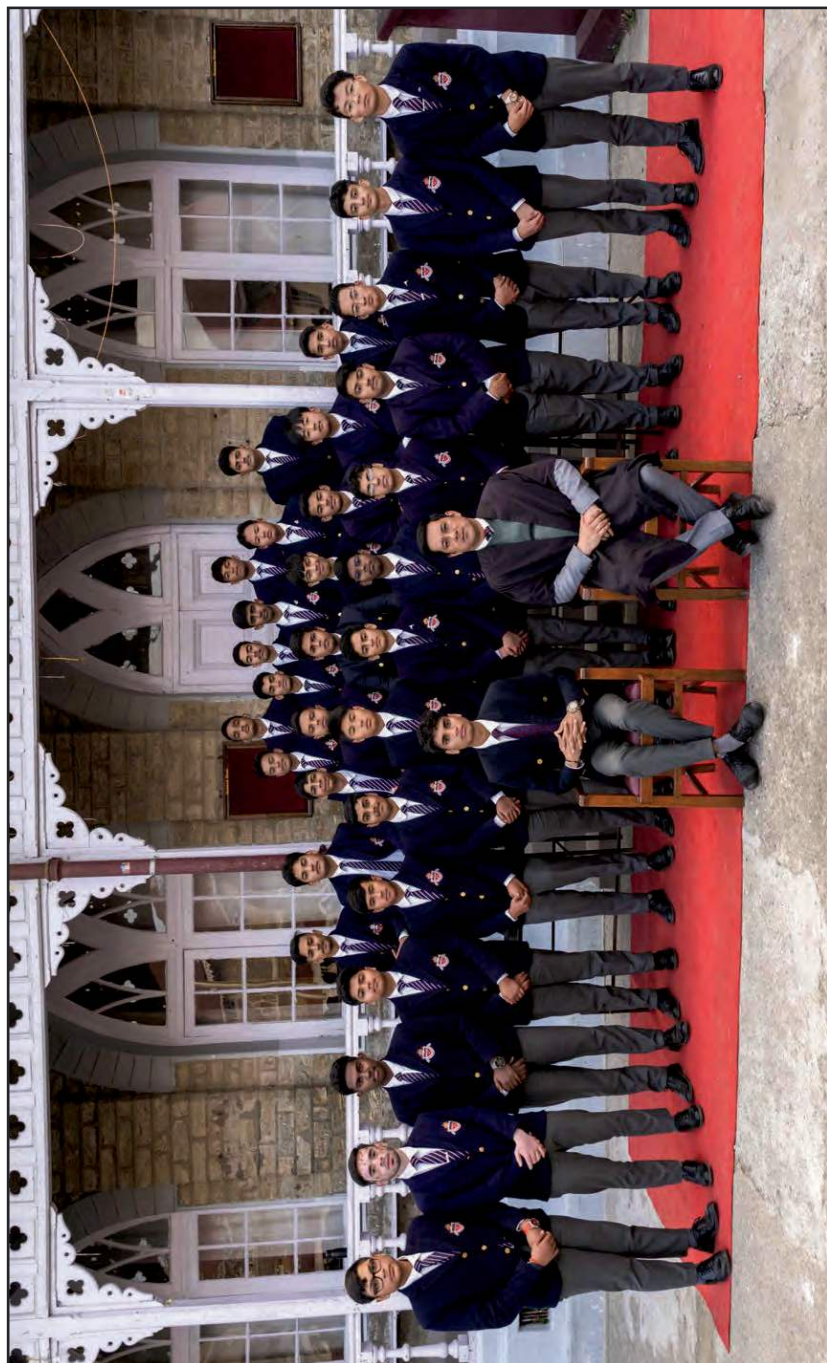
The Photography Club