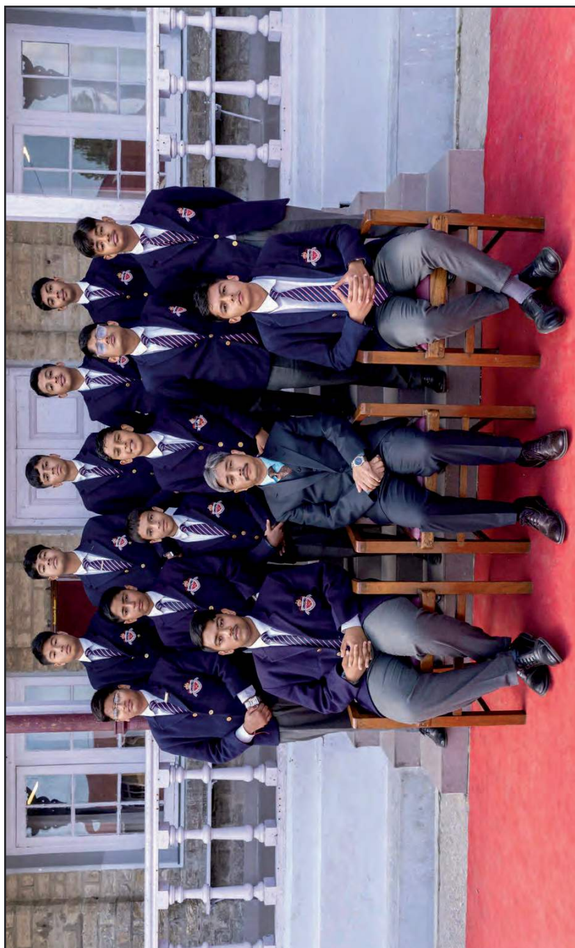
The Table Tennis Team