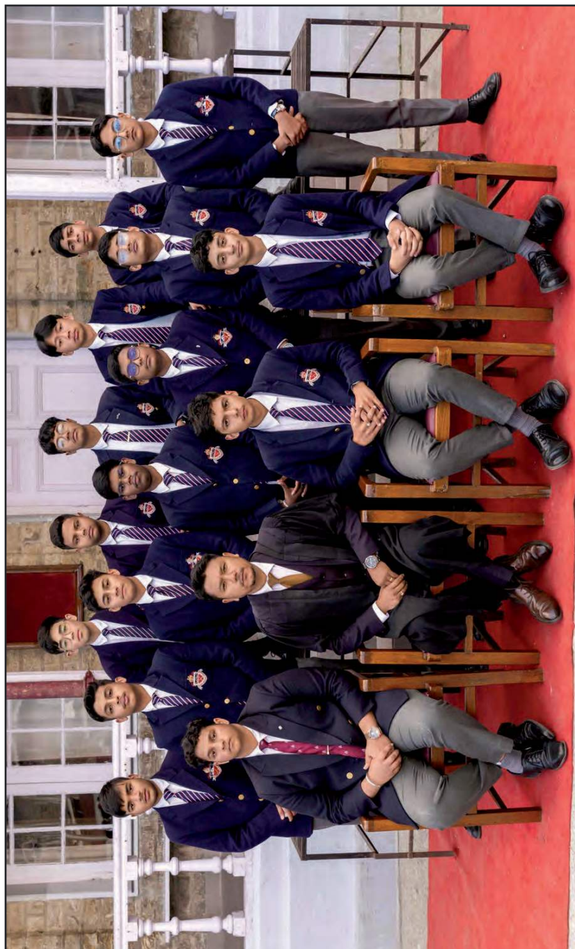
The Senior Wing Elocution Team