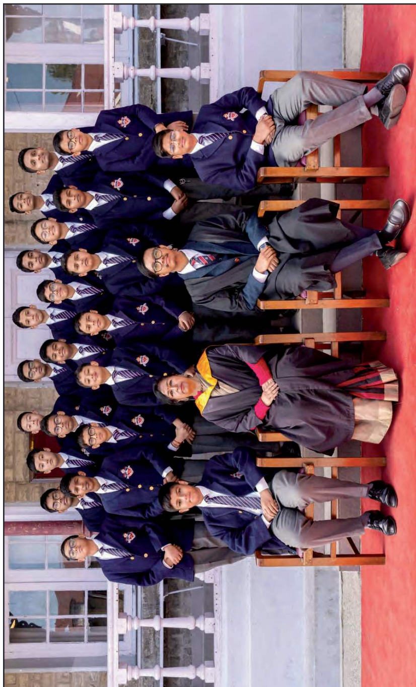
The Junior Wing Debating Team