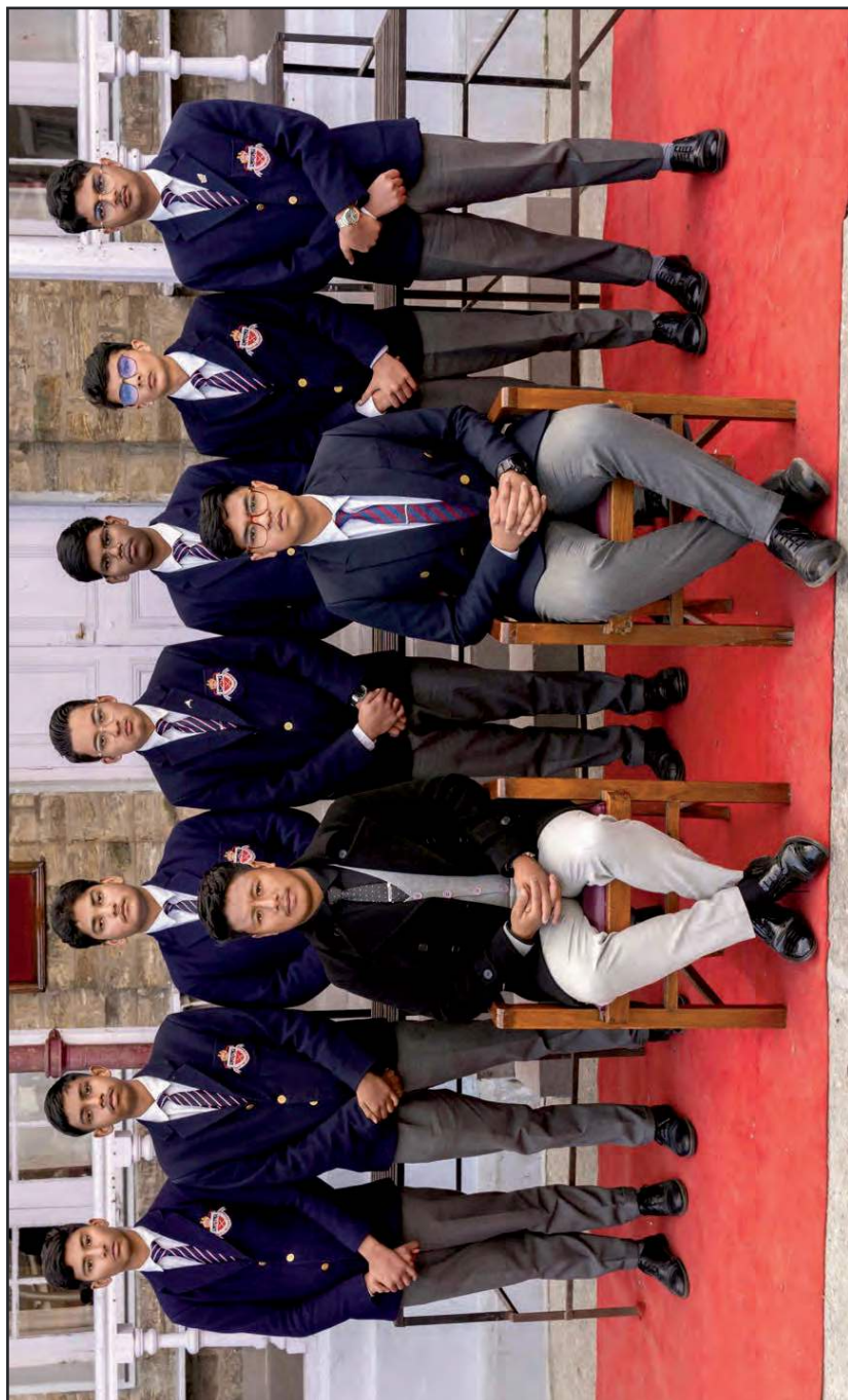
The Lawn Tennis Team