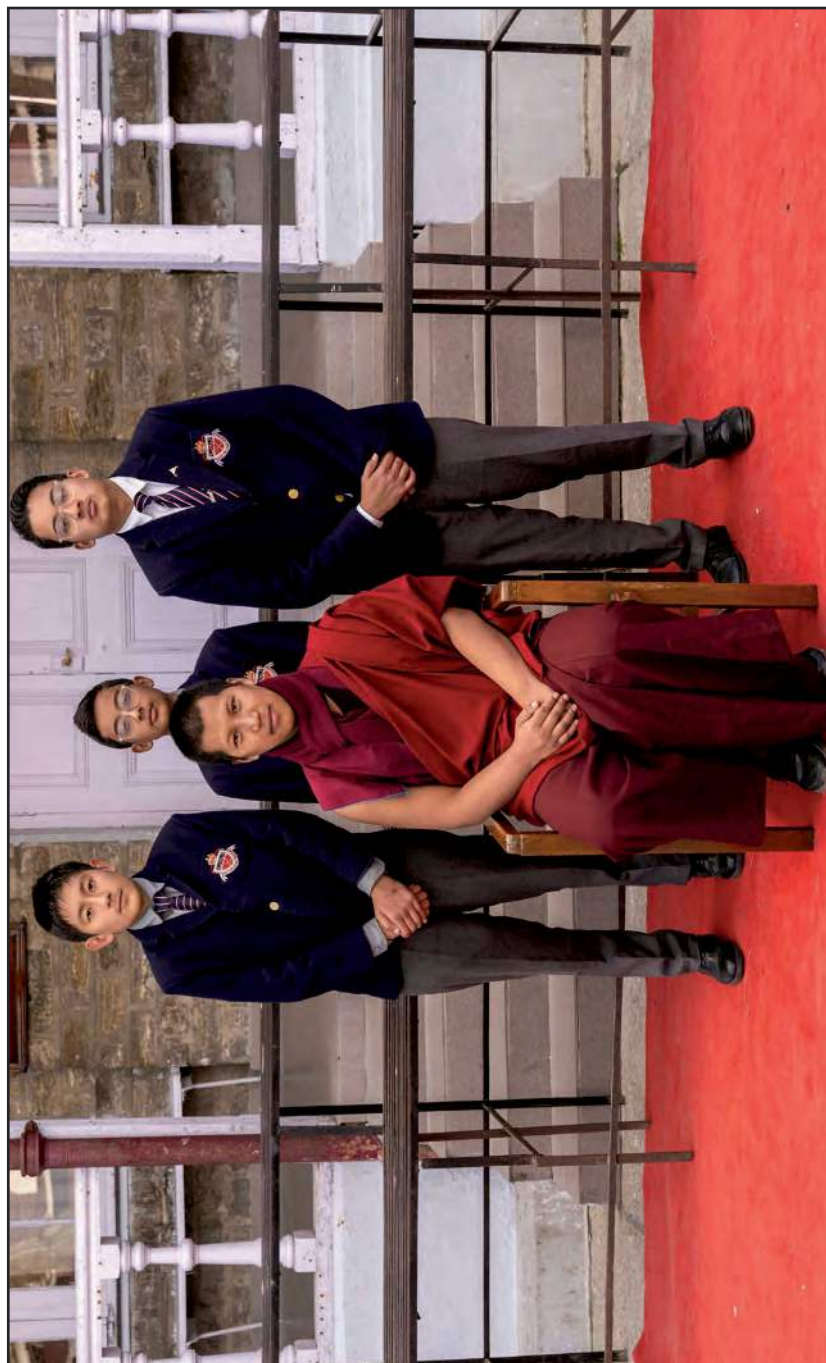
The Dzongkha Society