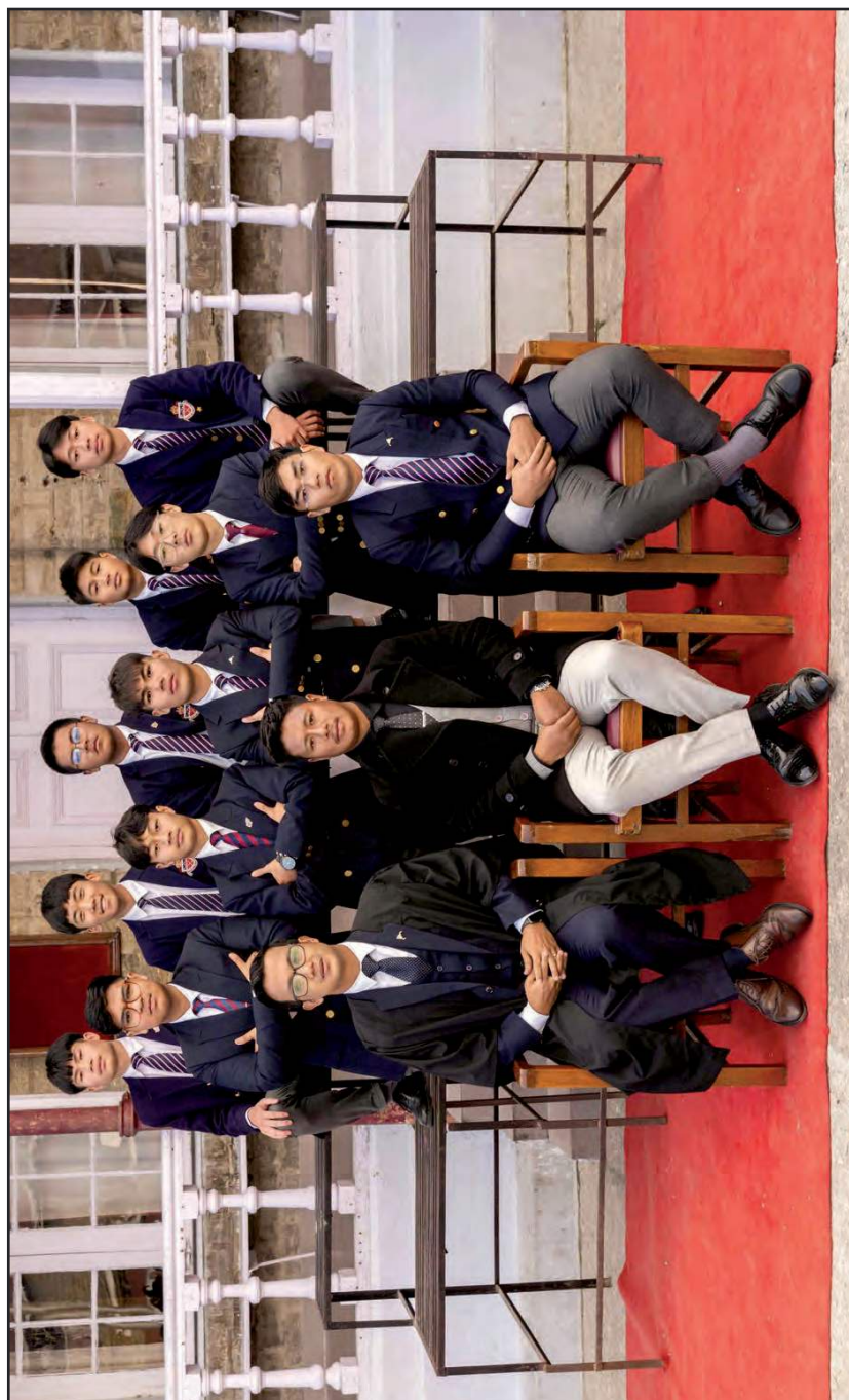
The ISC Basketball Team