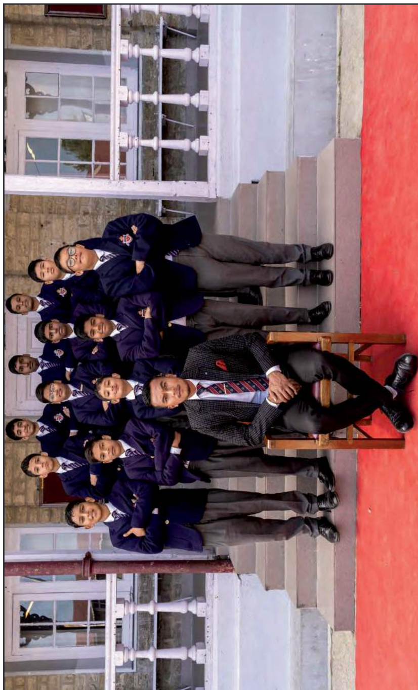
The Under 8 Volleyball Team