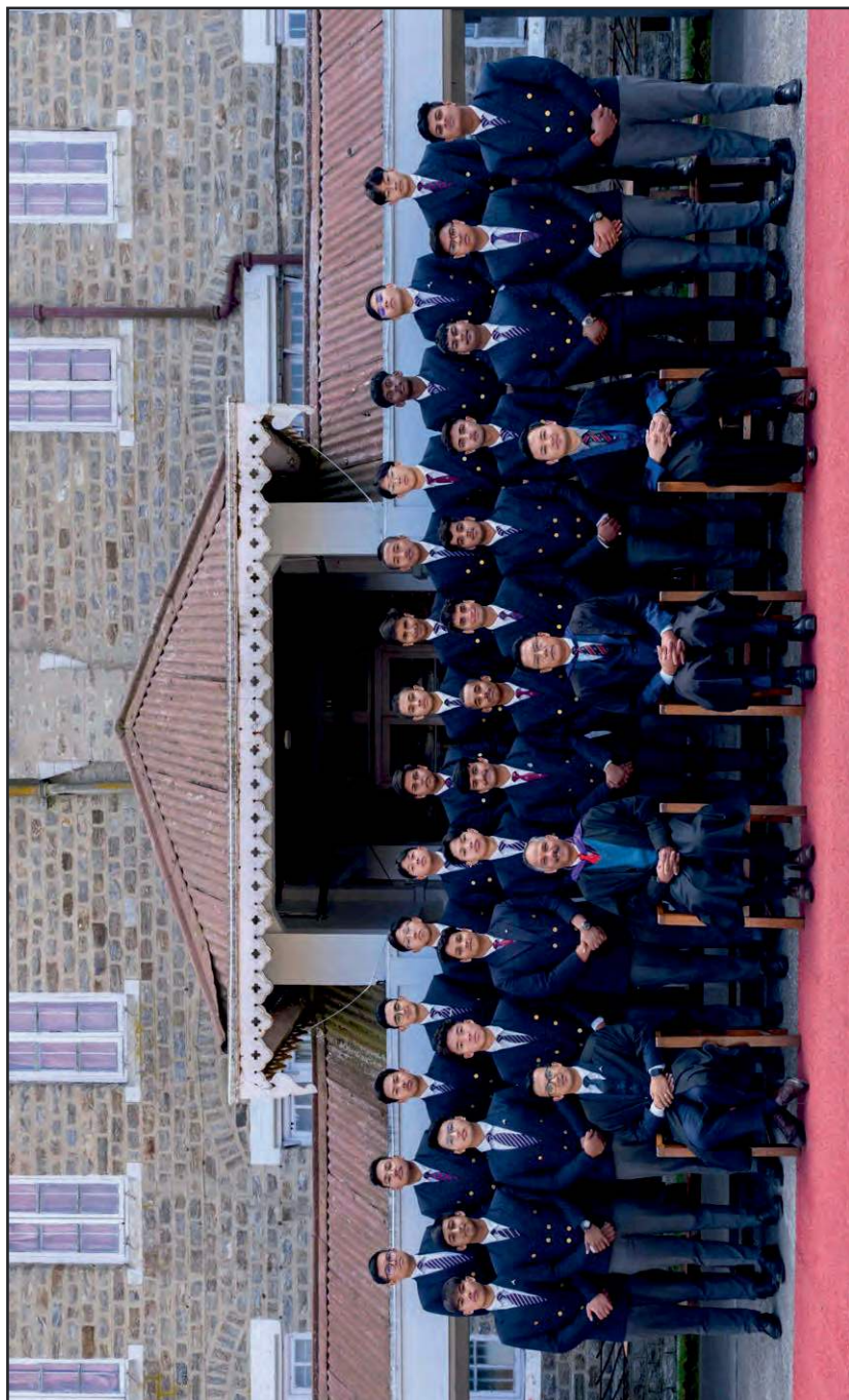
The ISC Batch 2024