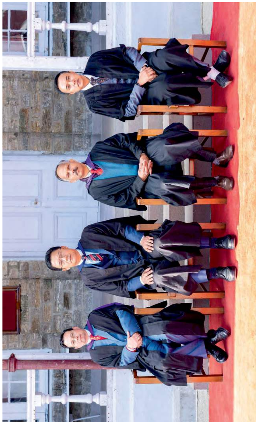
The Chronicle Team