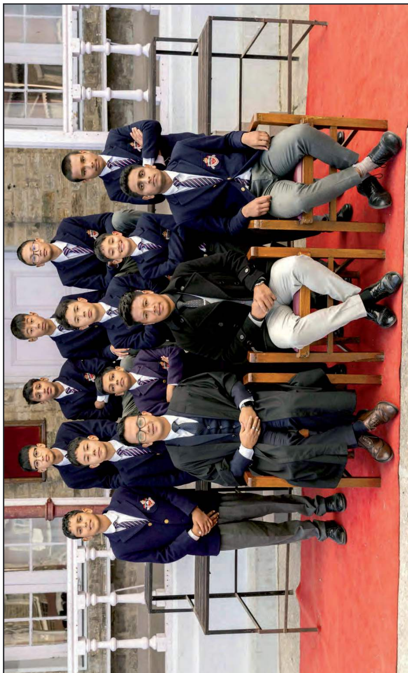
The Under 8 Basketball Team