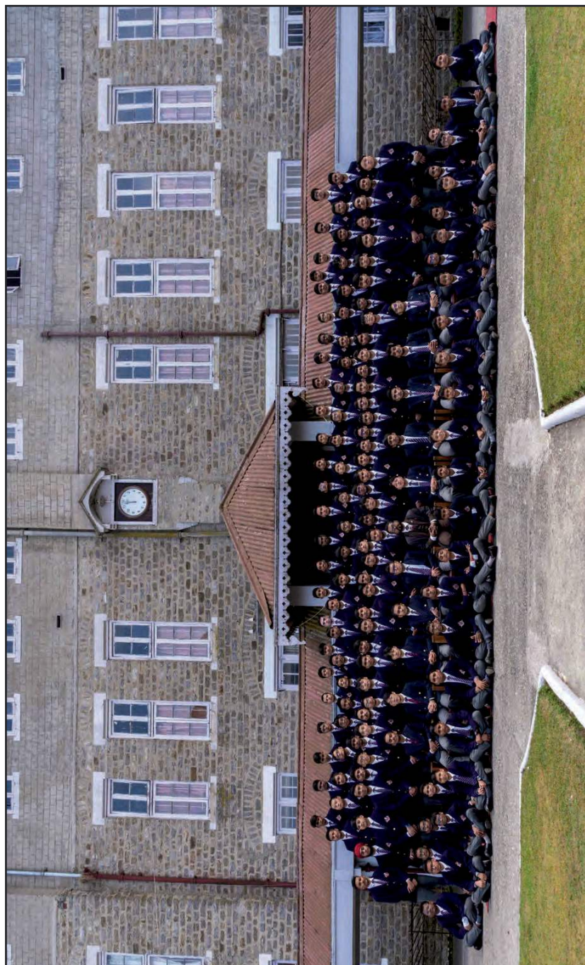
The Art and Craft Club