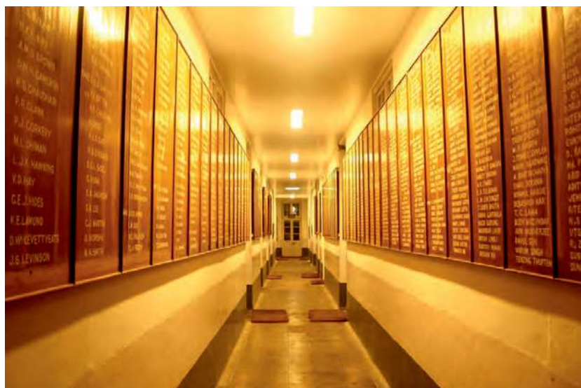
The Hallowed Corridor