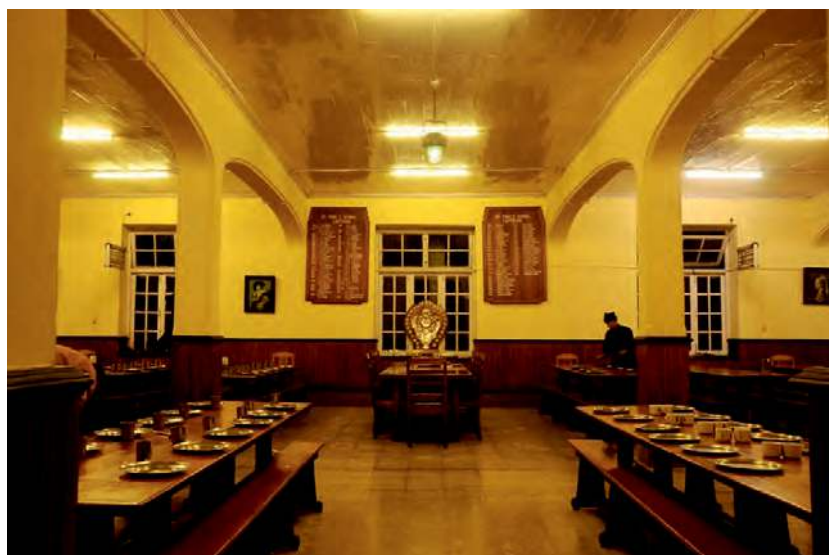
The School Dining Hall