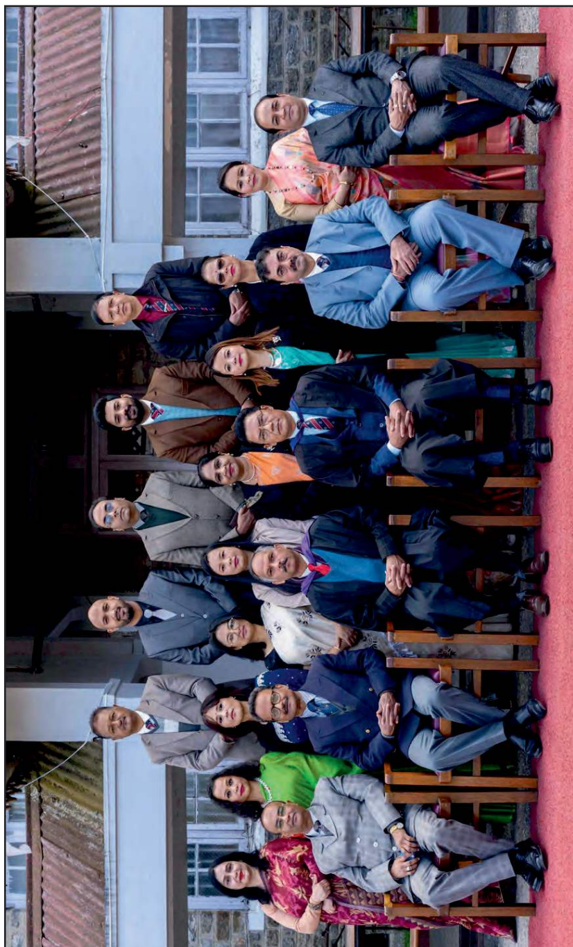
The Administrative Staff