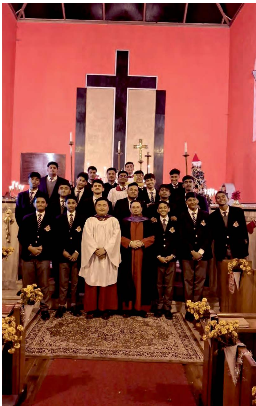
Dean with Chapel Wardens