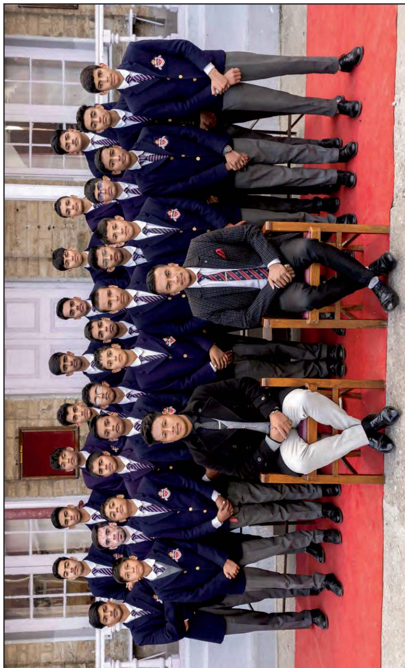
The Athletics Team