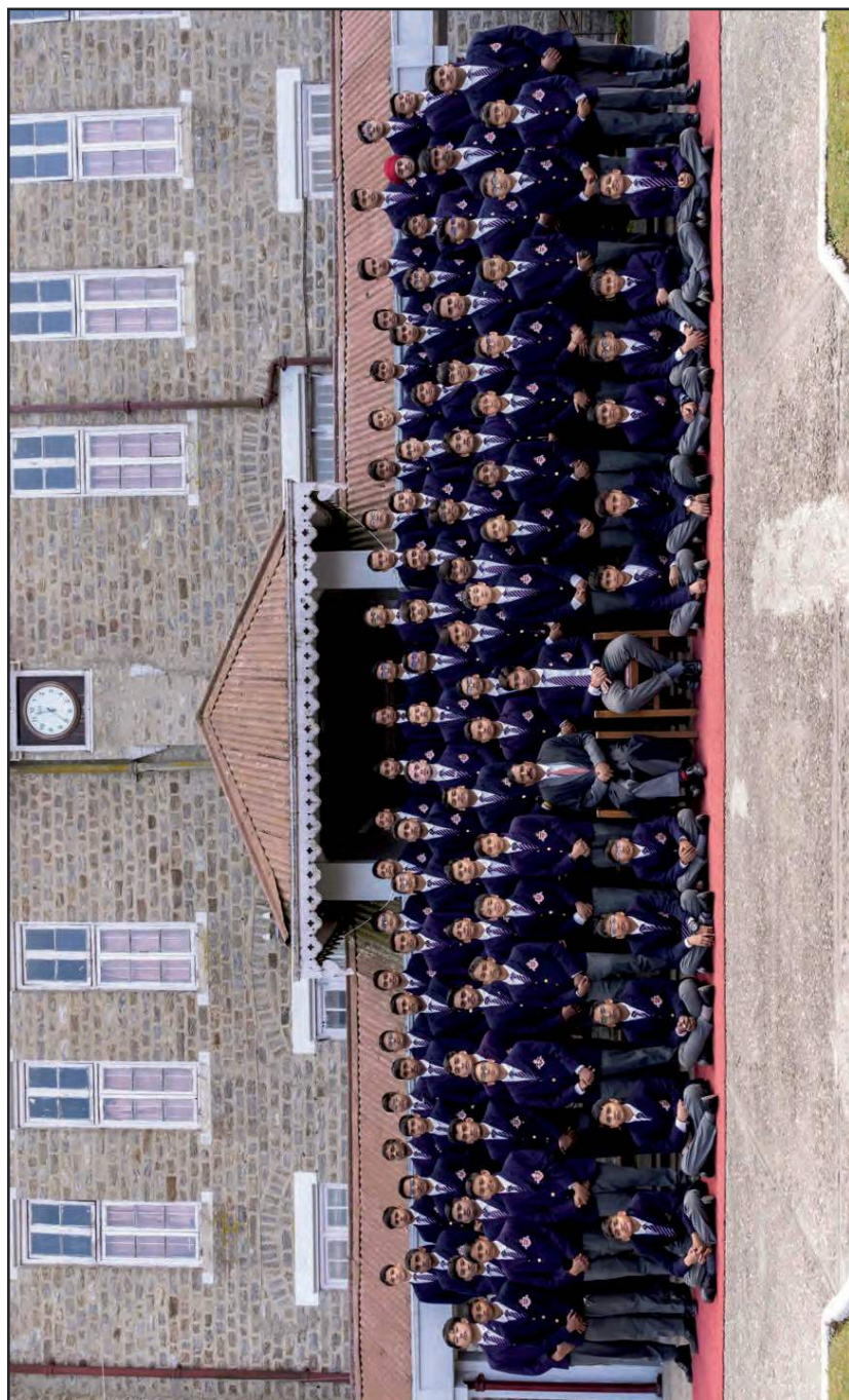
The Philately Club