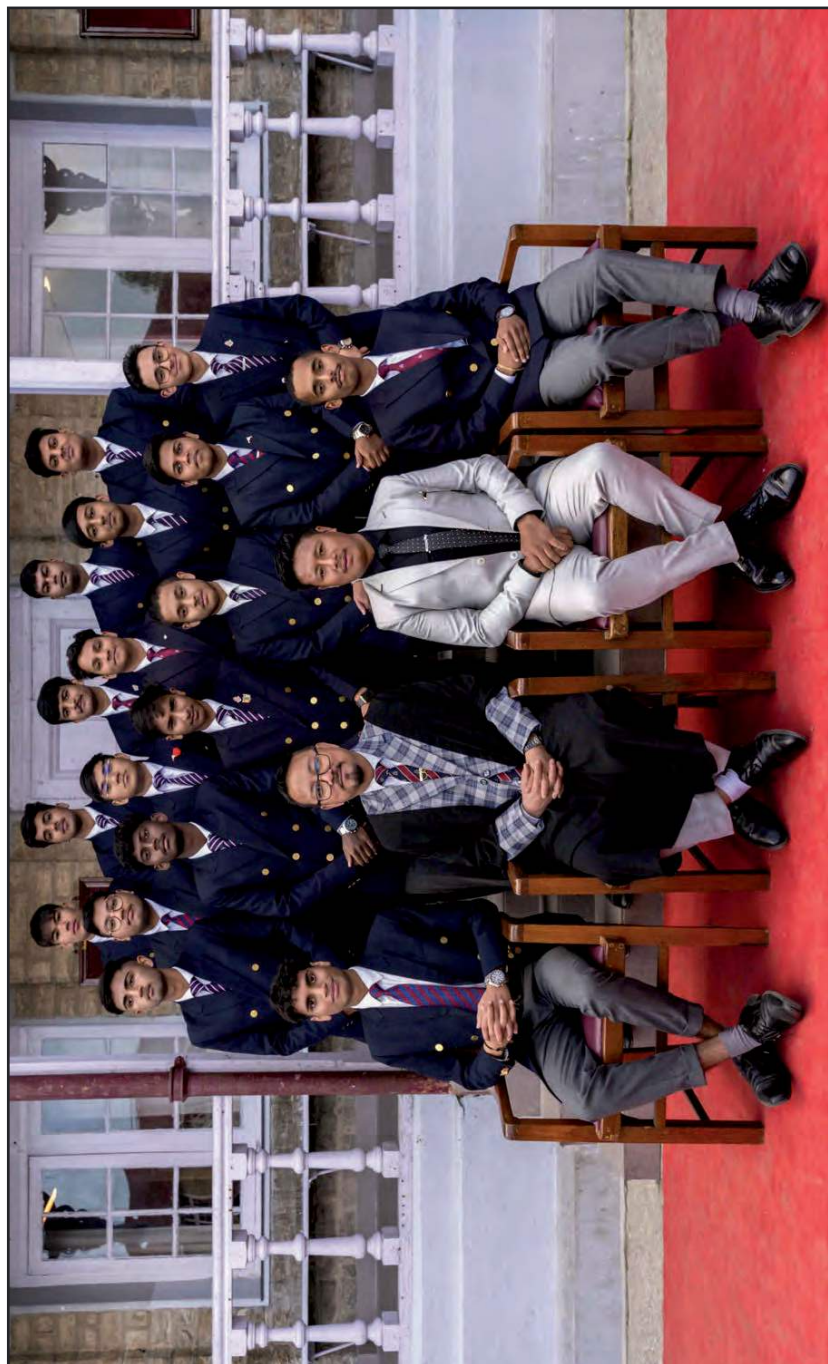
The Plus 2 Cricket Team