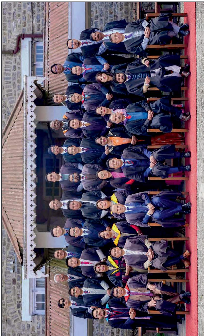
The Junior Wing Staff