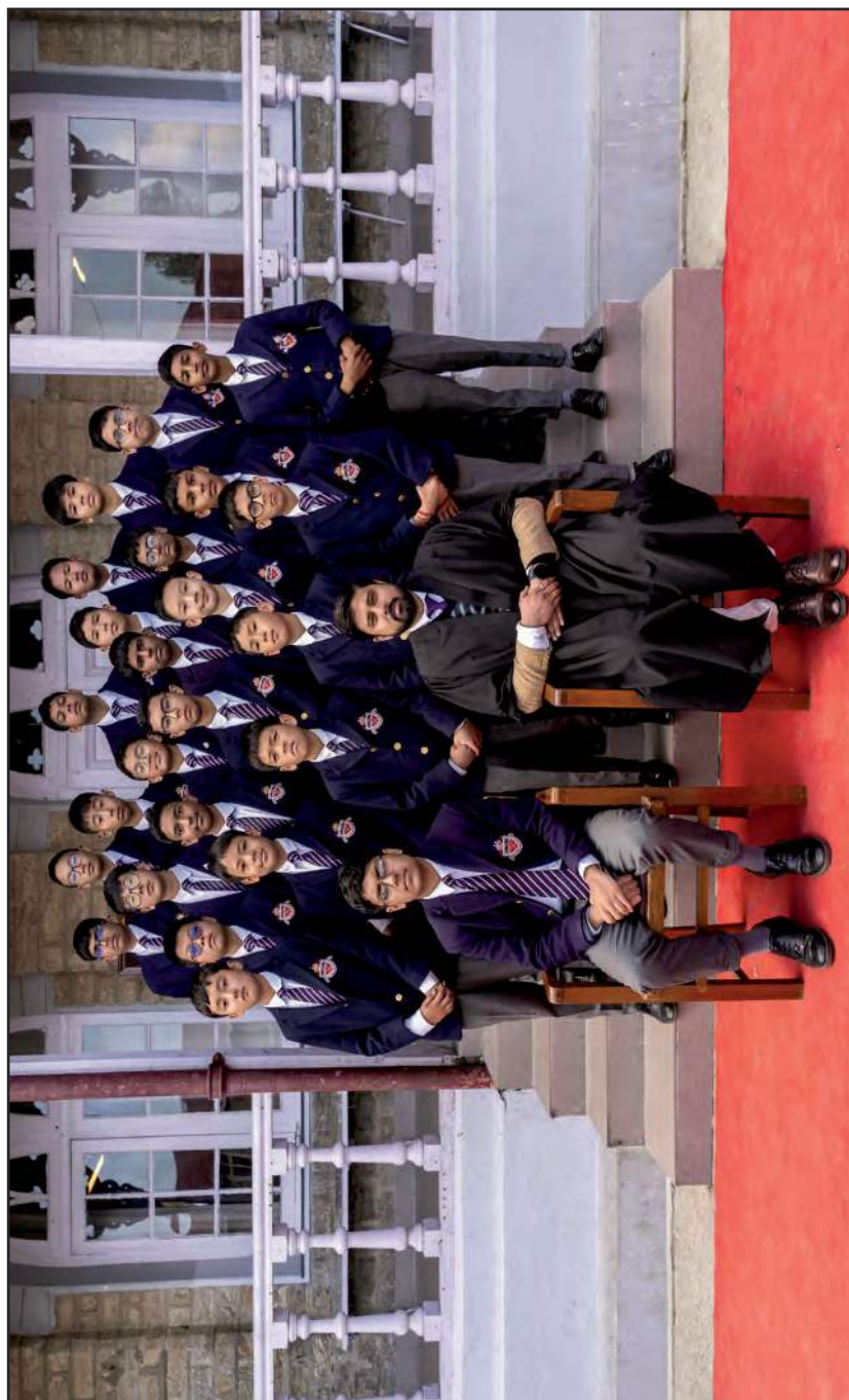
The French Society