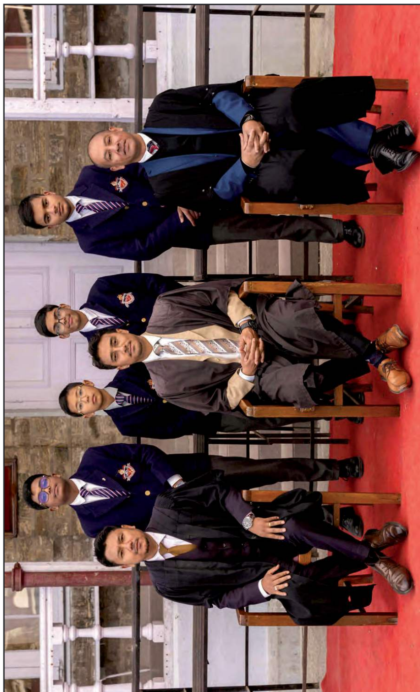
The N.M. Master Elocution Team