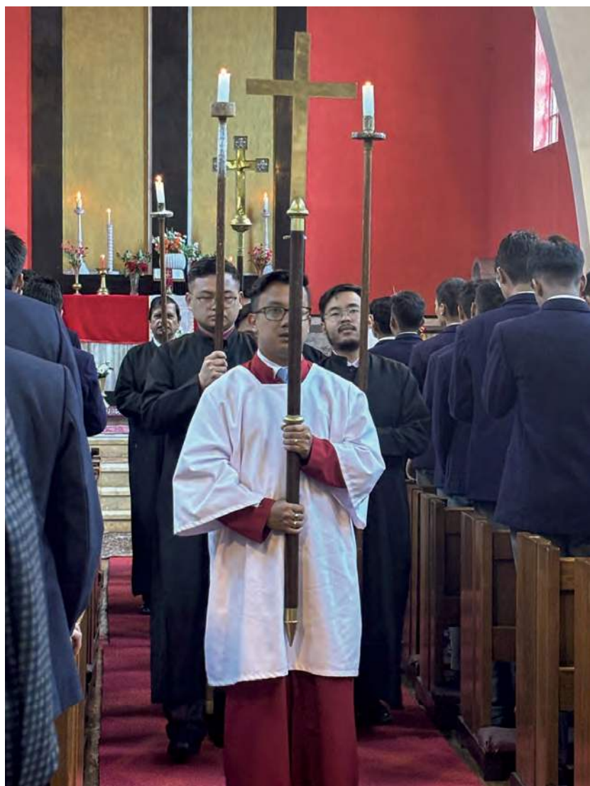
Special Chapel Service