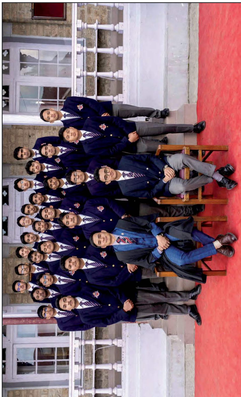
The Computer Club