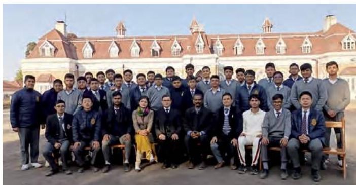
Crafting memories through teamwork and spirit