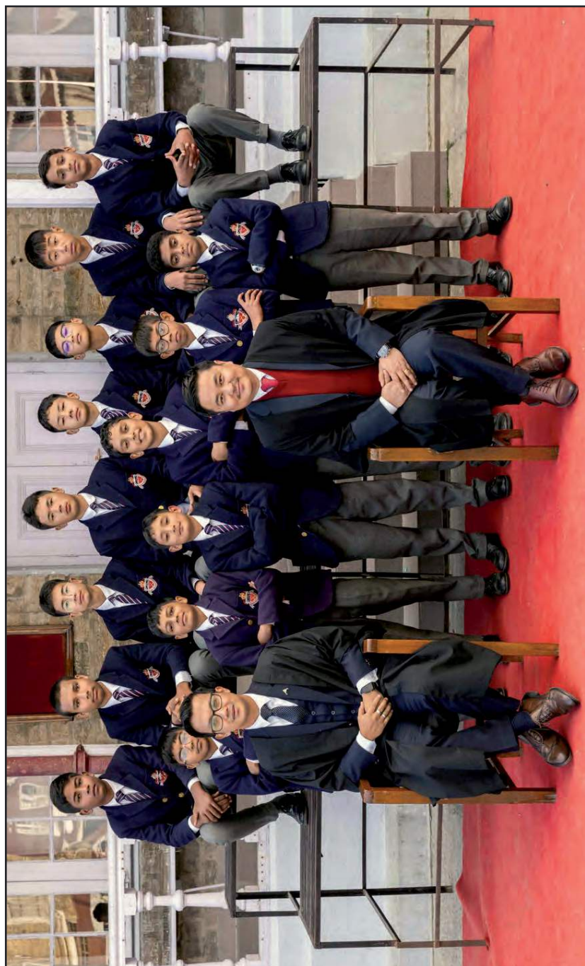
The Junior Wing Basketball Team