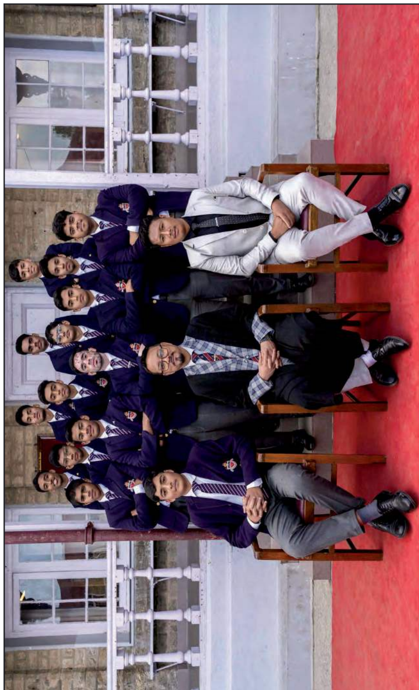
The Under 10 Cricket Team