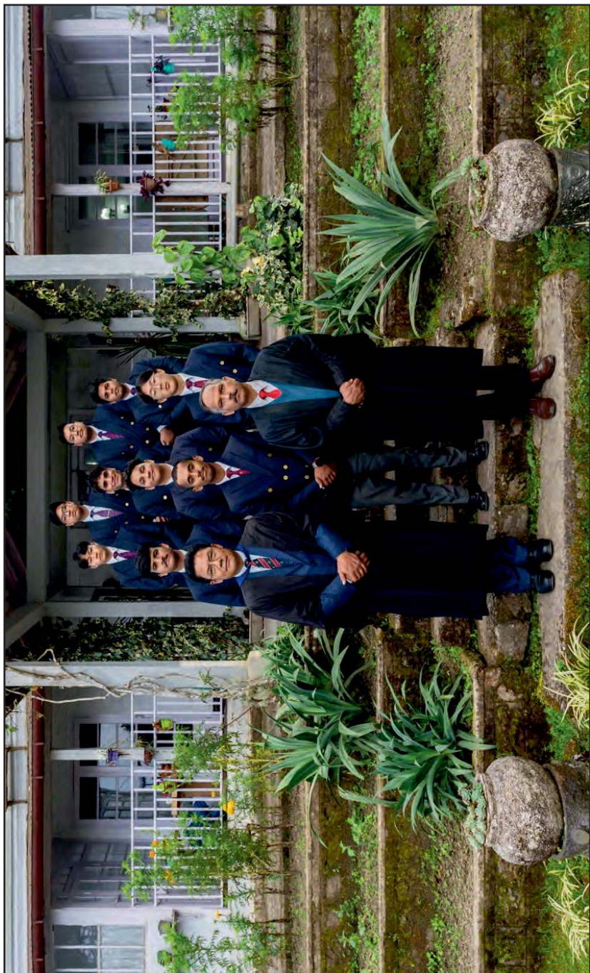
The Prefectorial Body 2024