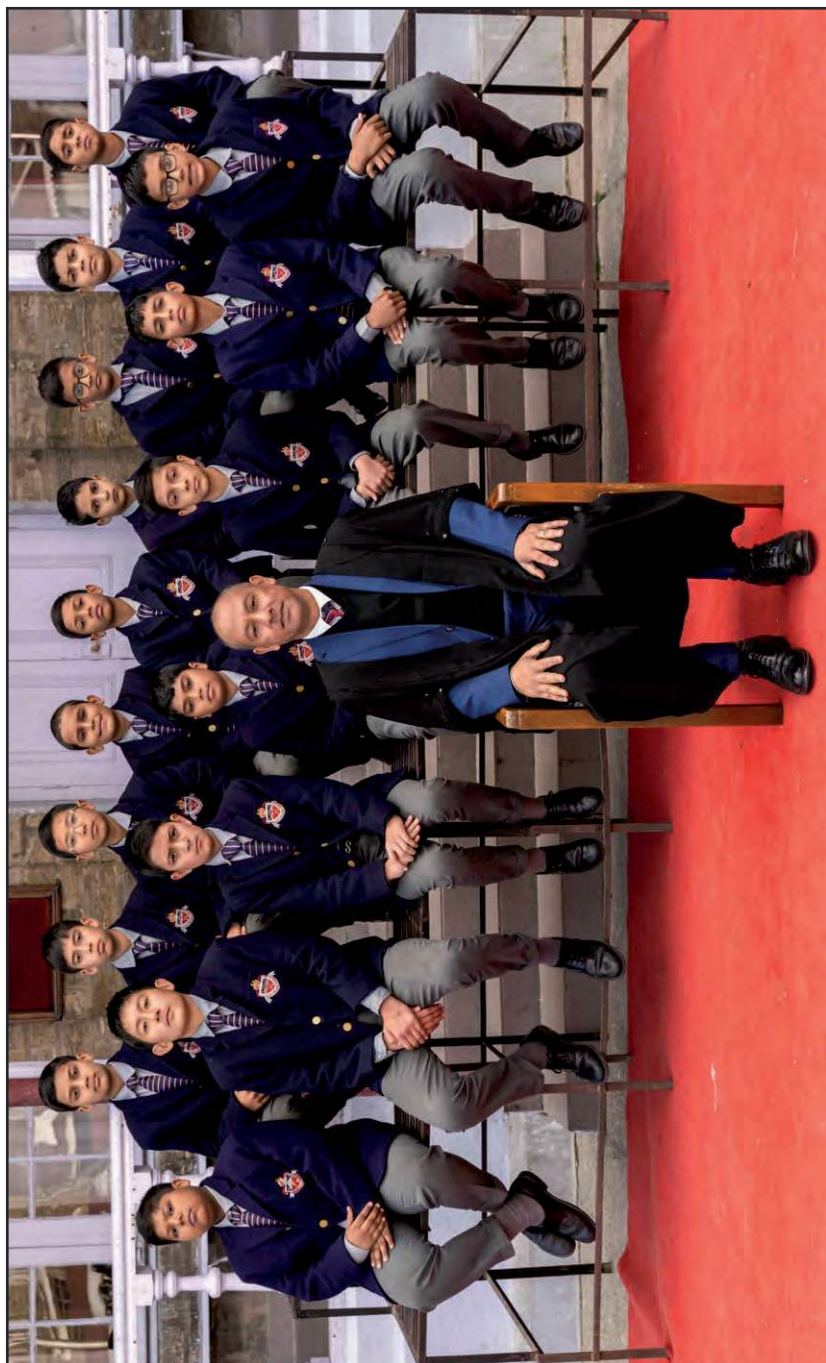
The Primary Wing Monitors