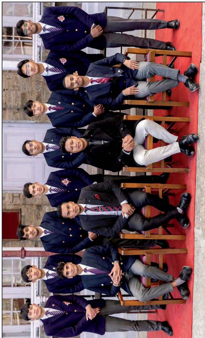
The Athletics Team