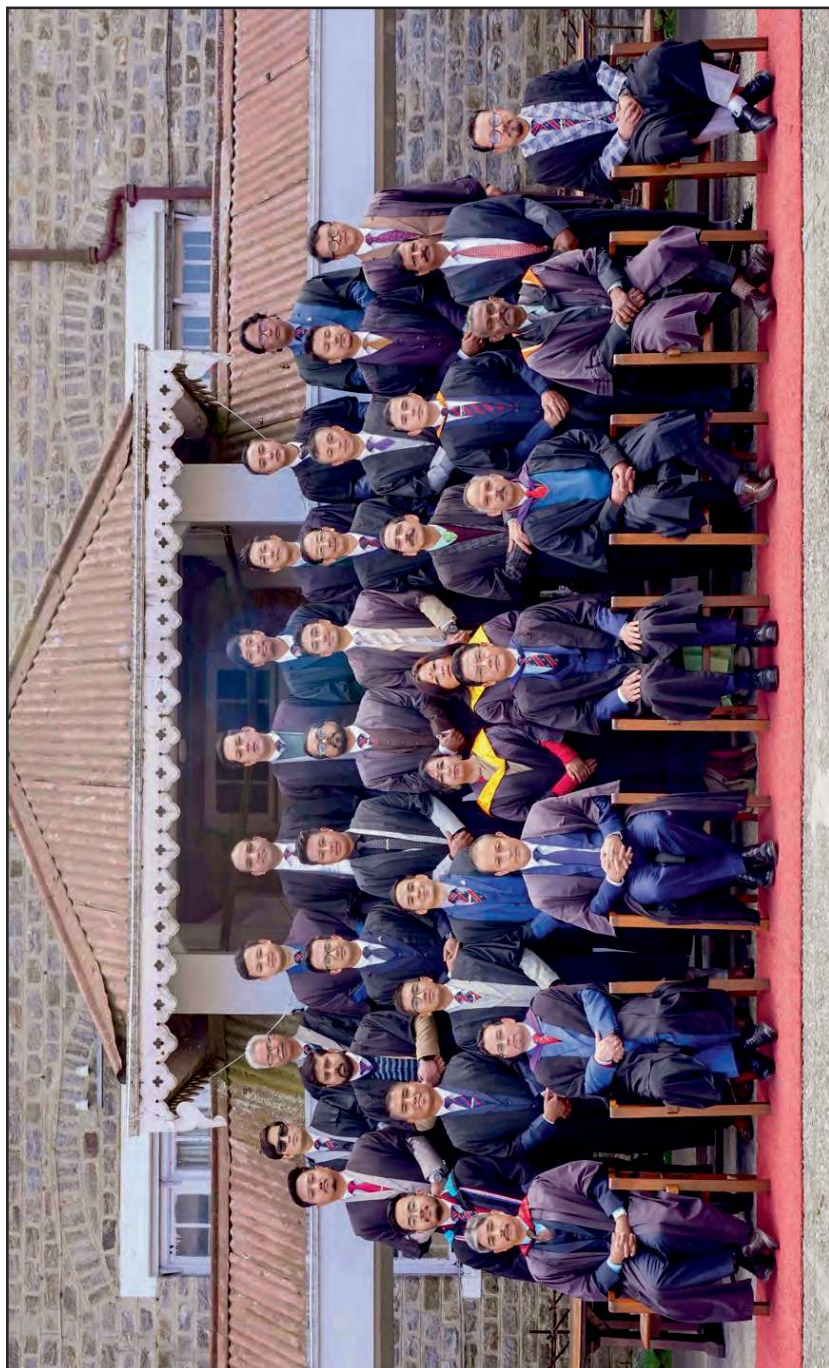
The Senior Wing Staff