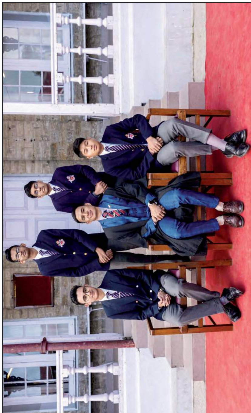
The Robotics Team