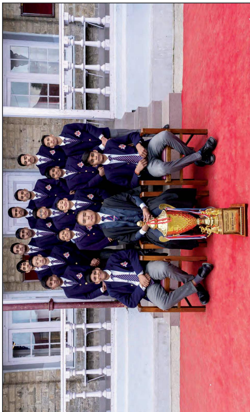
The Under 14 Cricket Team