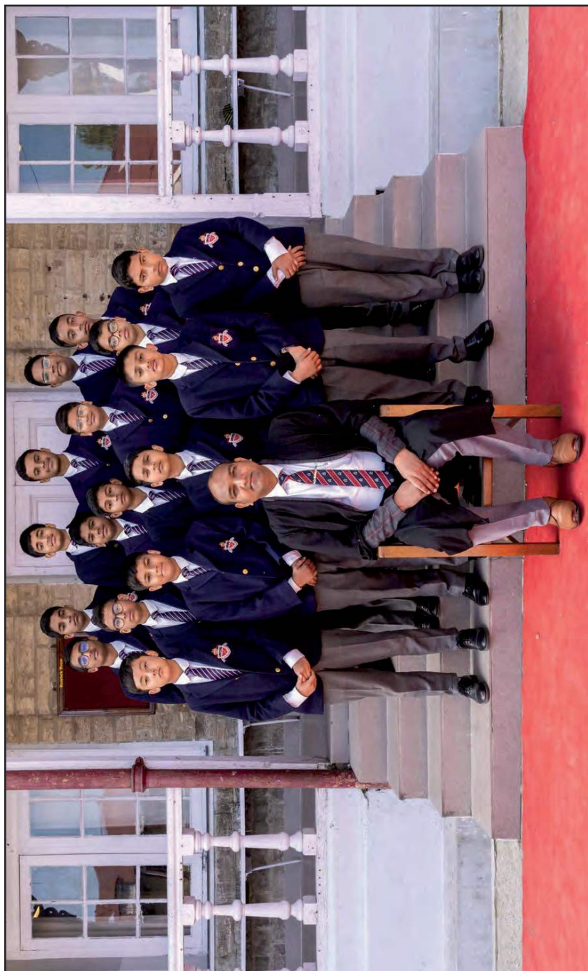
The Under 8 Cricket Team