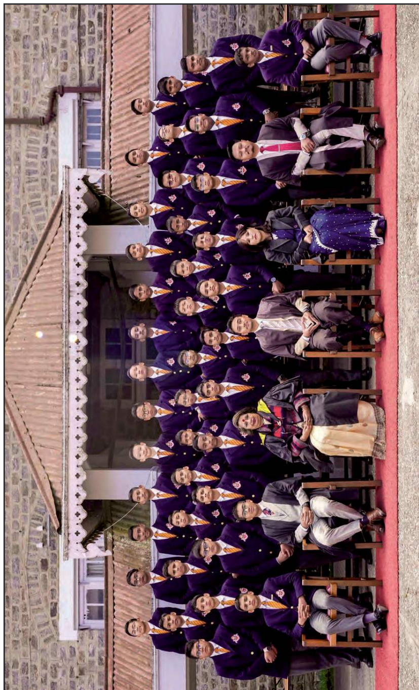
The Betten House