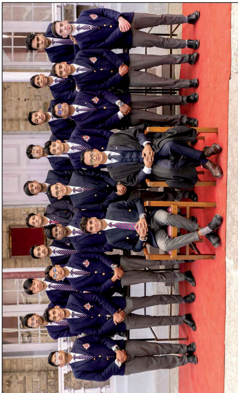
The Senior Wing Quiz Team