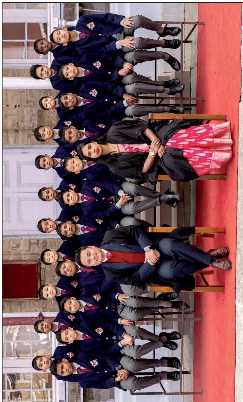
The Hunt House