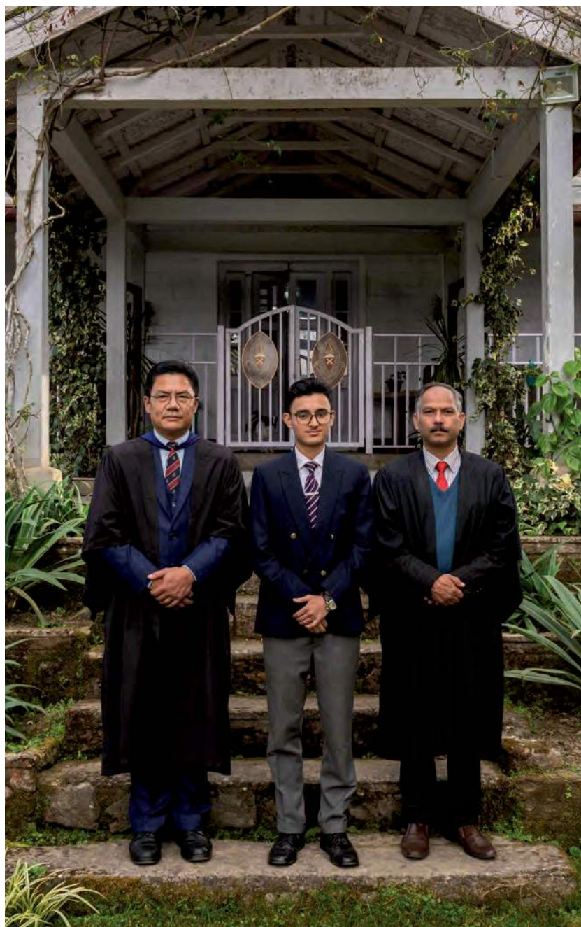
Boy completing 12 years