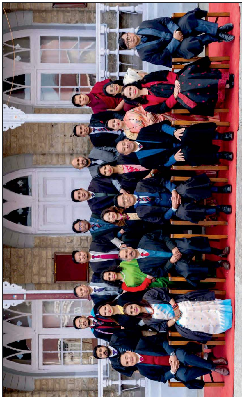
The Primary Wing Staff