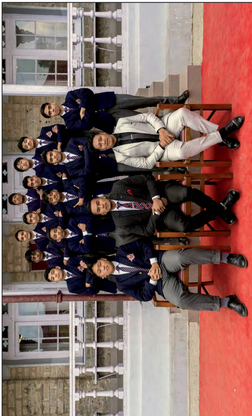
The ICSE Volleyball Team