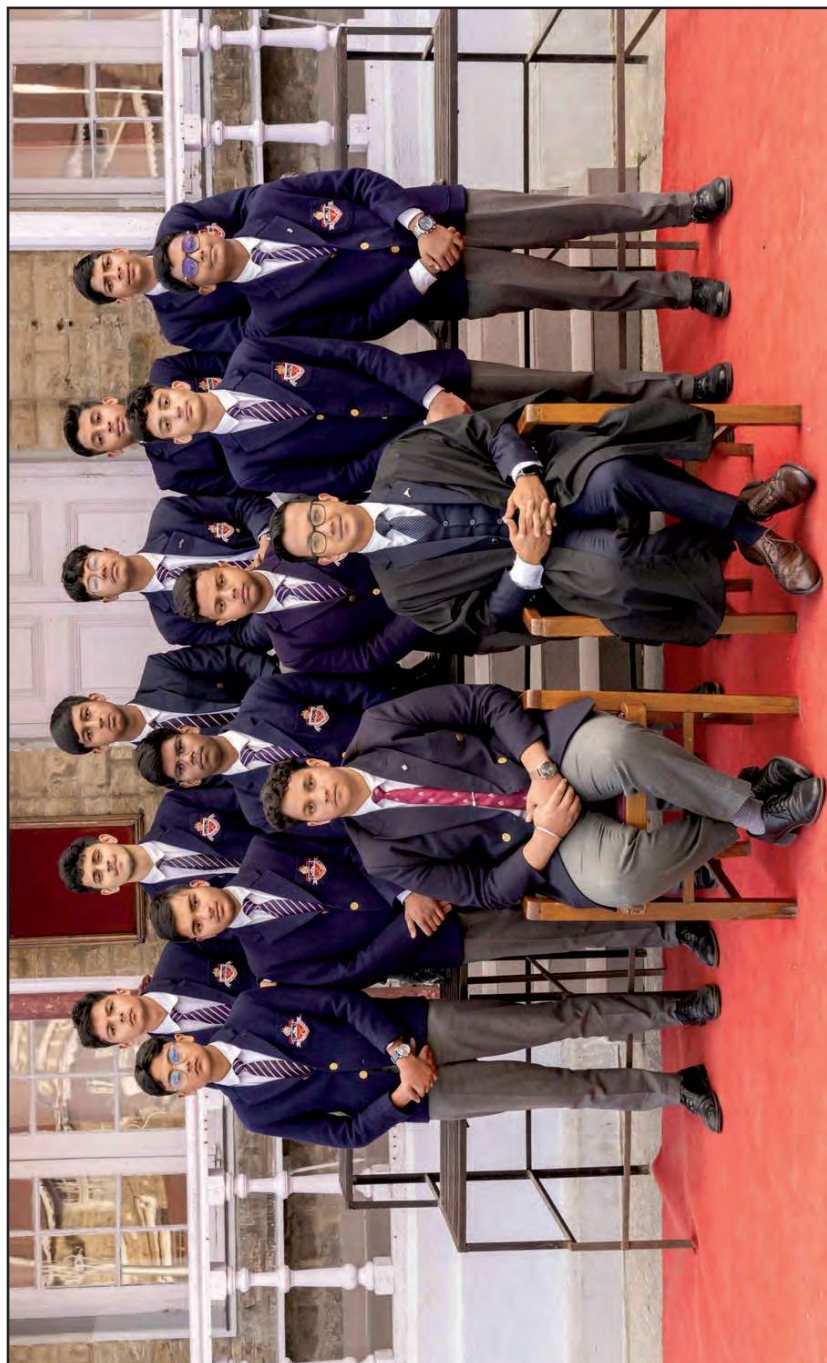
The Senior Wing Debating Team