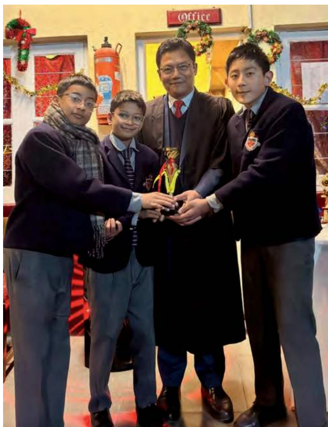
Primary Wing Exhibitions