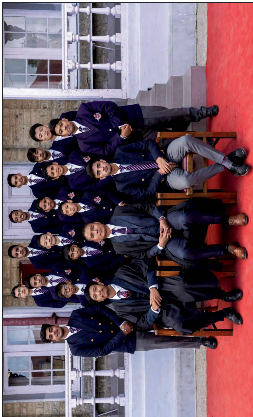
The School Badminton Team