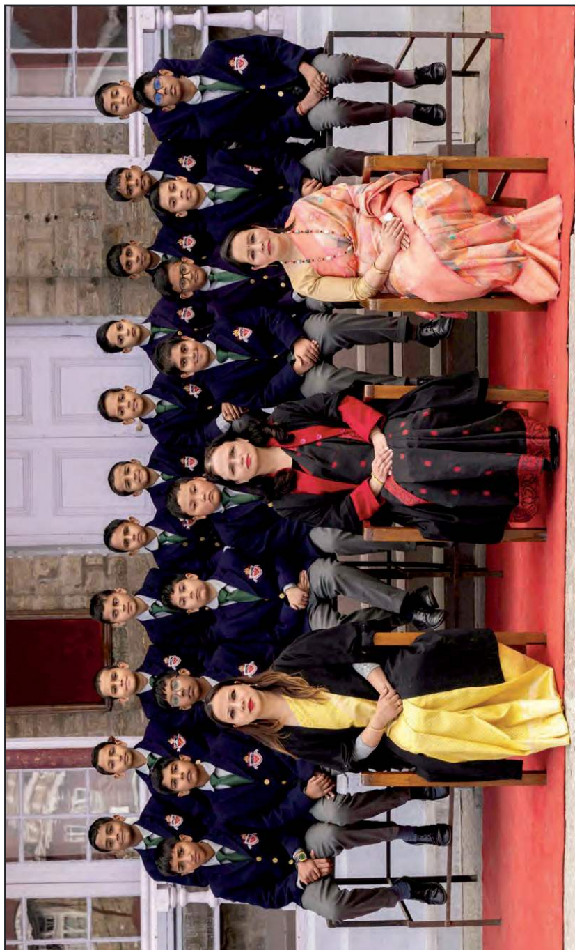
The Hillary House