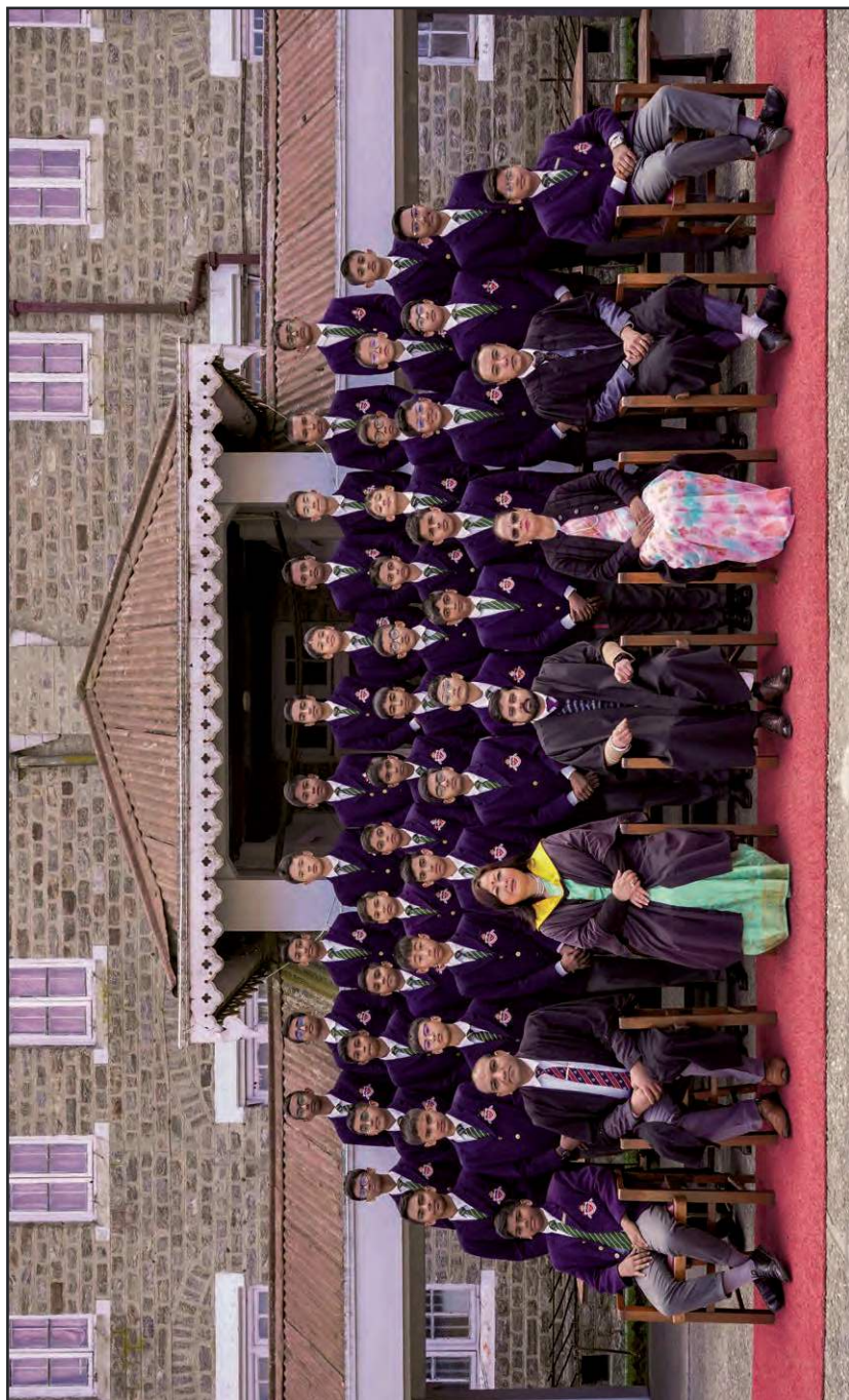
The Cable House