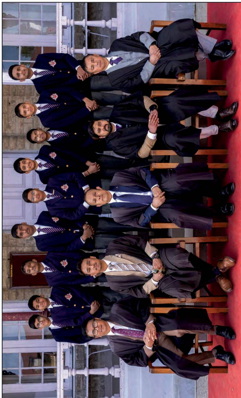
The Junior Wing Monitors