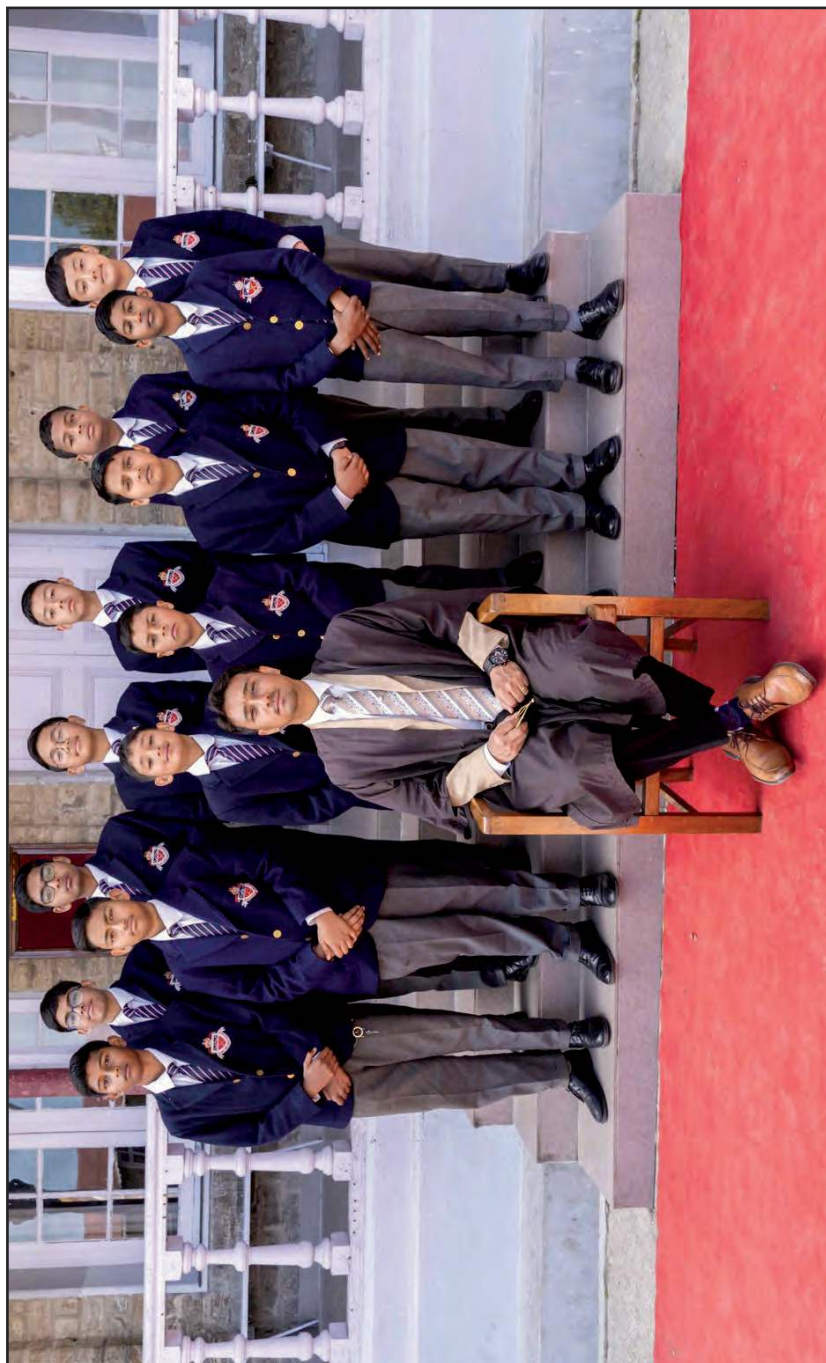
The Junior Wing Elocution Team