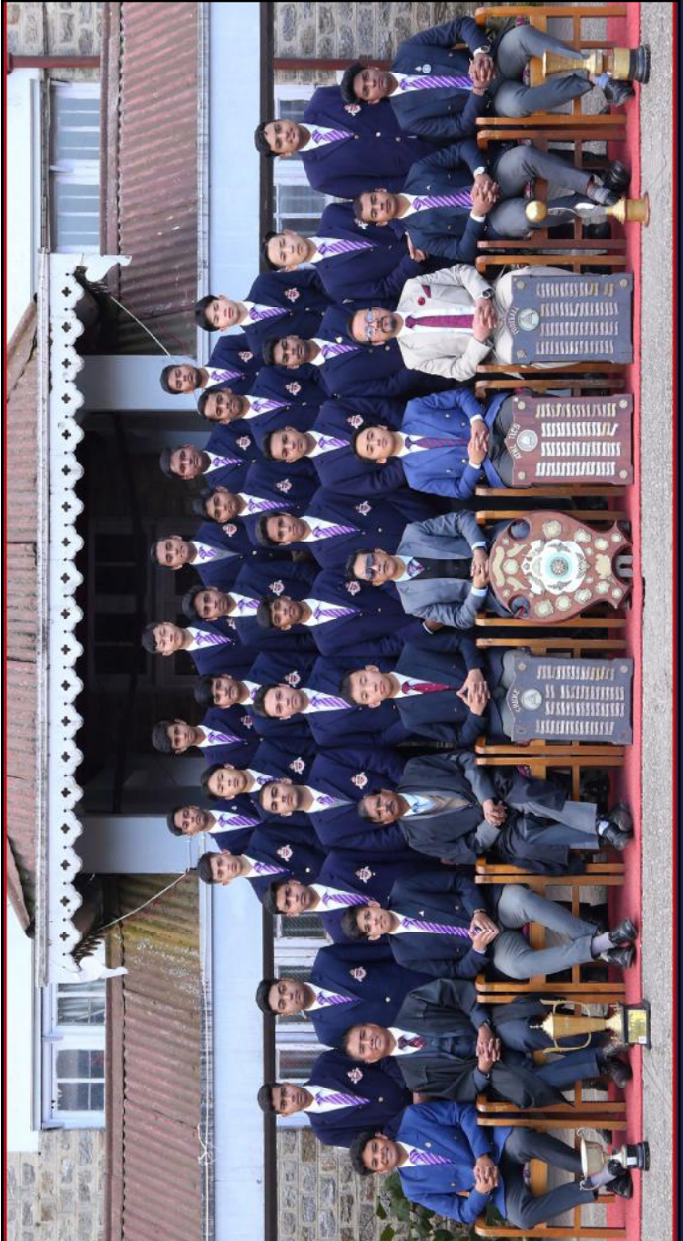
Havelock House, 2022