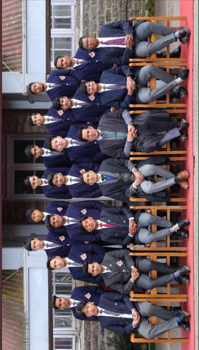
Computer Society, 2022