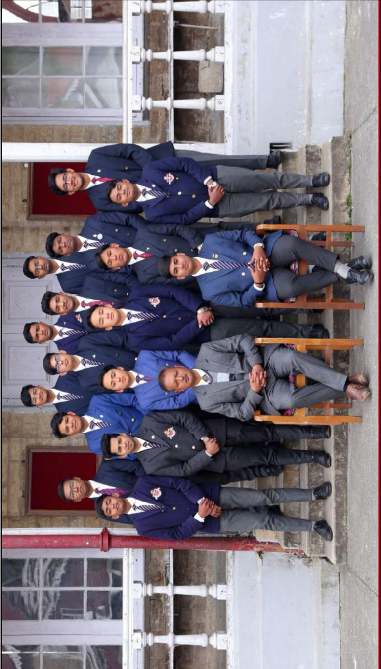
Senior Wing Cricket Team, 2022