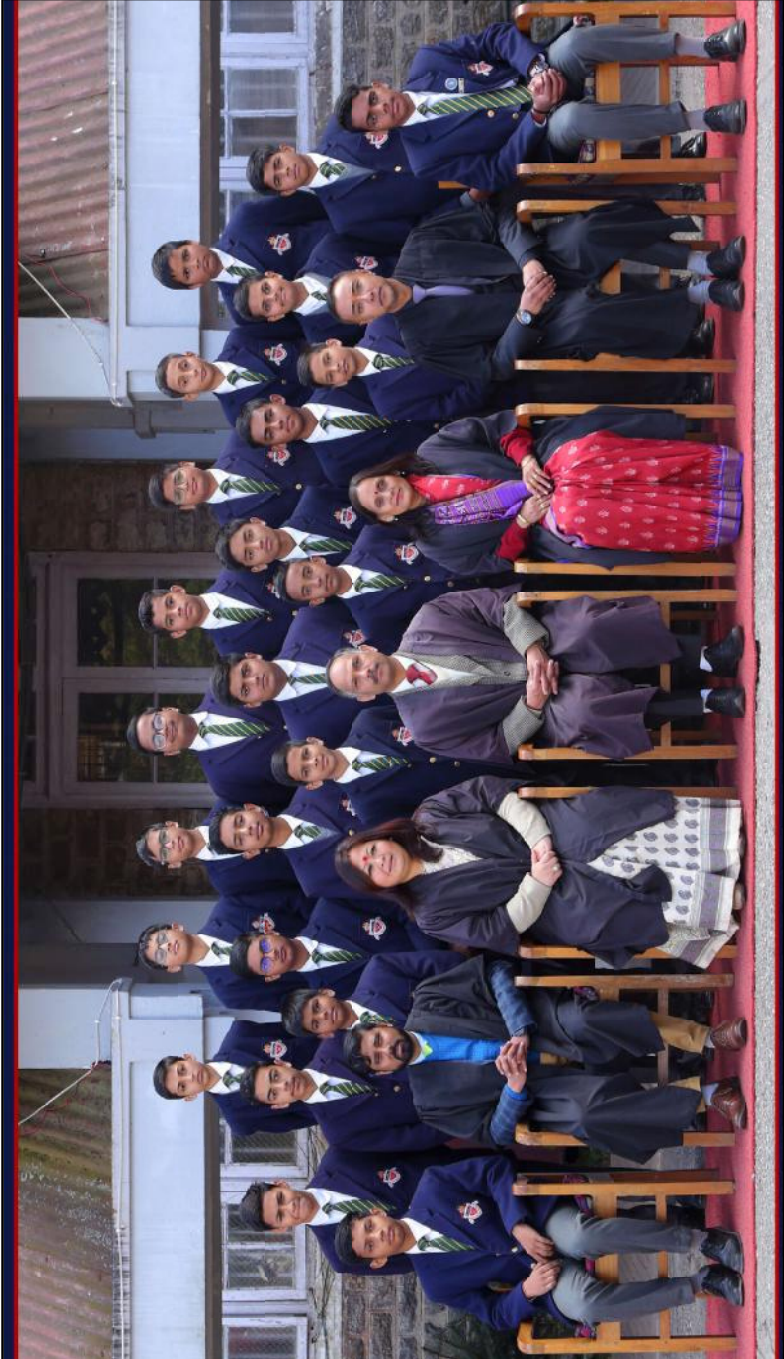
Cable House, 2022