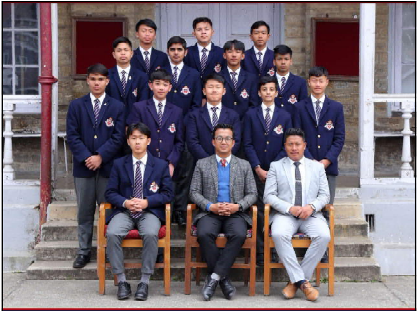
ICSE Basketball Team, 2022