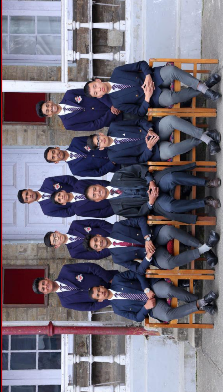
Senior Wing Badminton Team, 2022