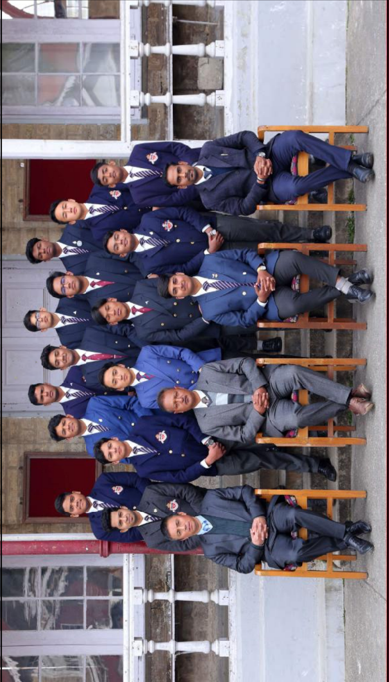
Edinburgh Cricket Team, 2022