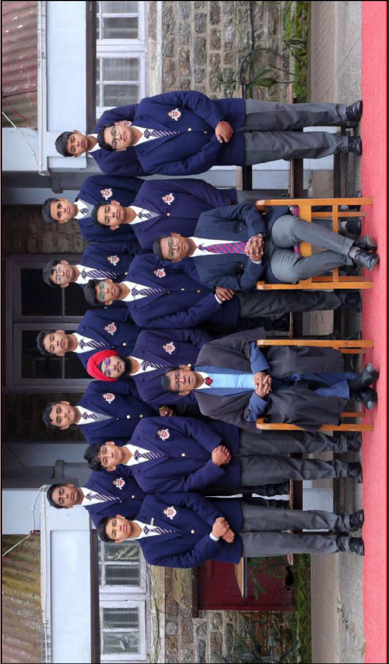
The Chapel Wardens