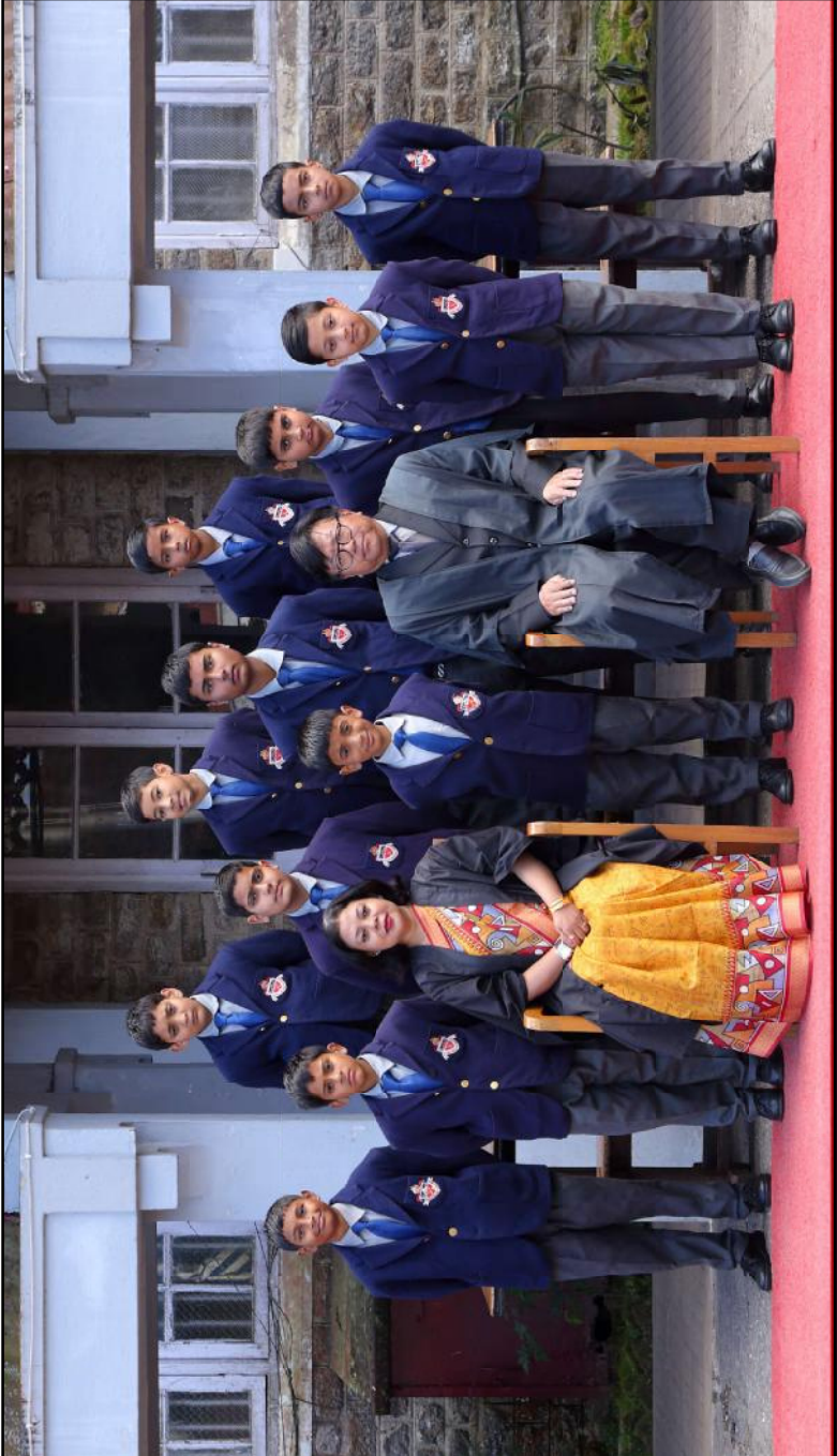
Tenzing House, 2022