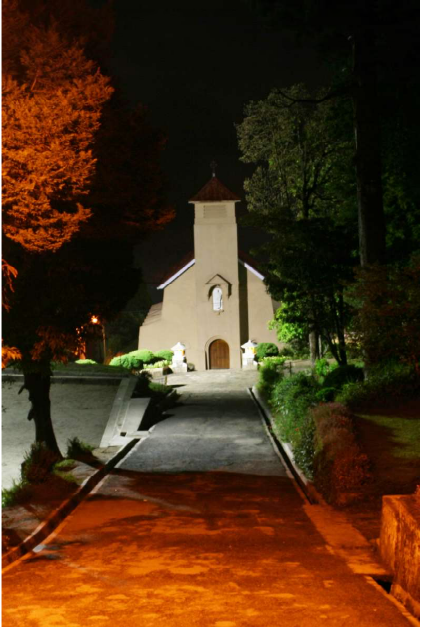
The School Chapel