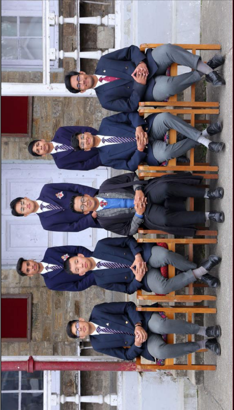
Senior Wing Quizzing Club, 2022