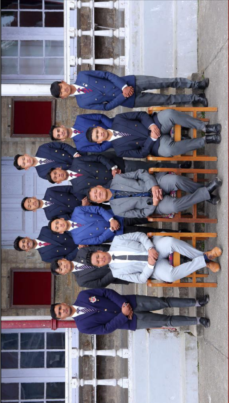
ISC Volleyball Team, 2022