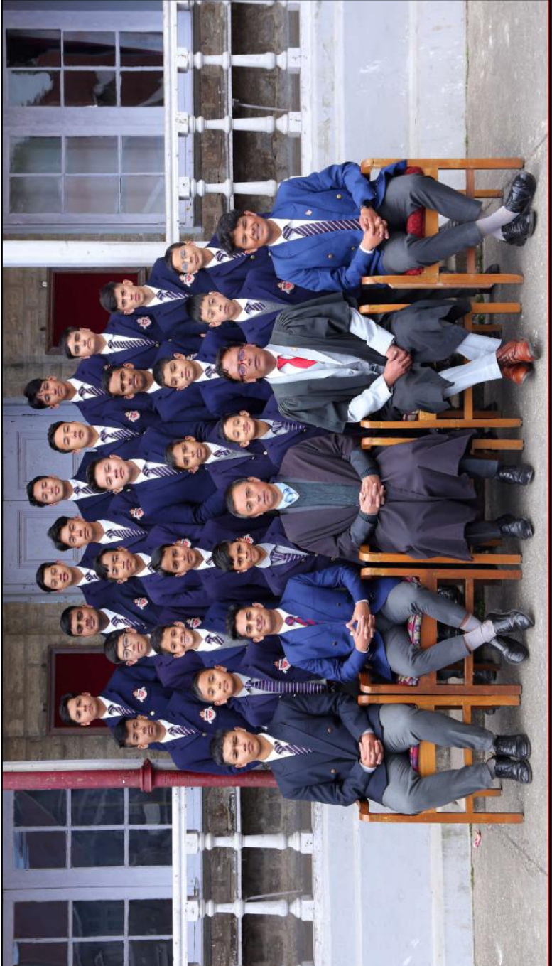
Nepali Society, 2022