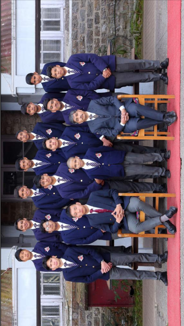
School Table-Tennis Team, 2022