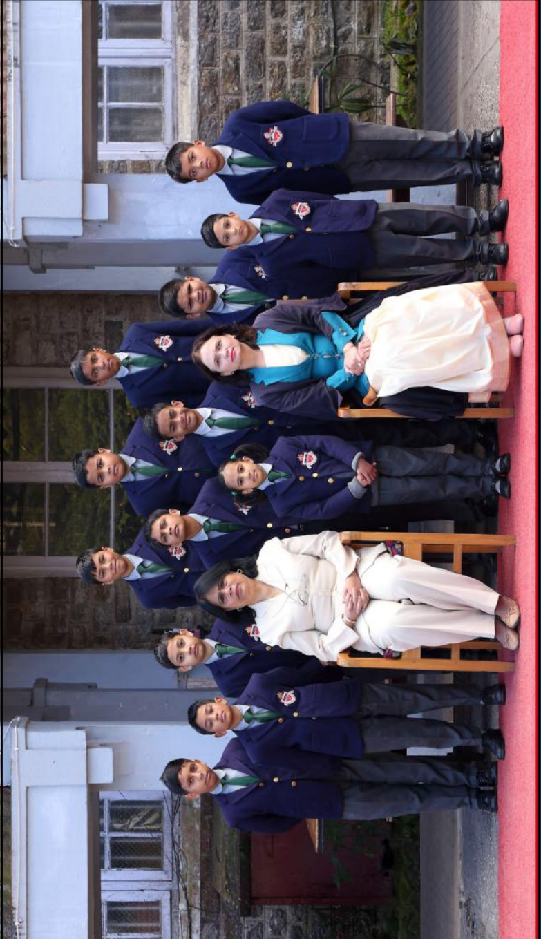
Hillary House, 2022