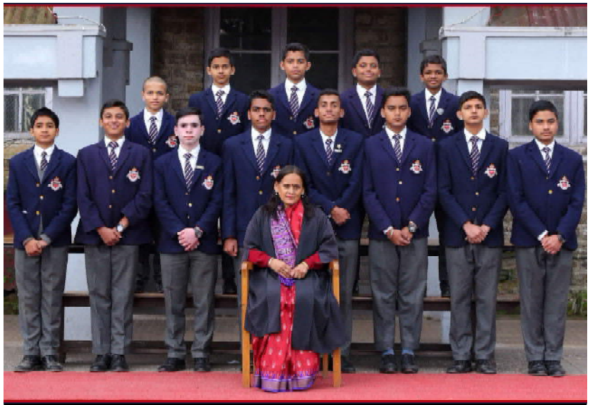
Junior Wing Hindi Elocution