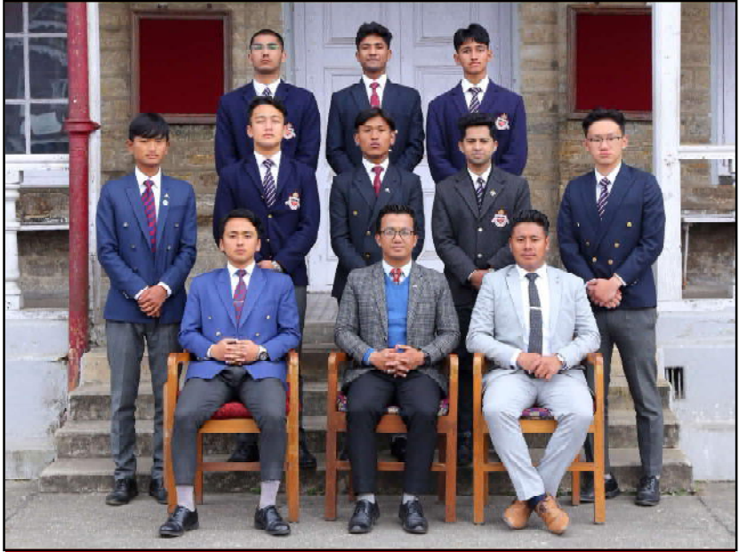
ISC Basketball Team, 2022