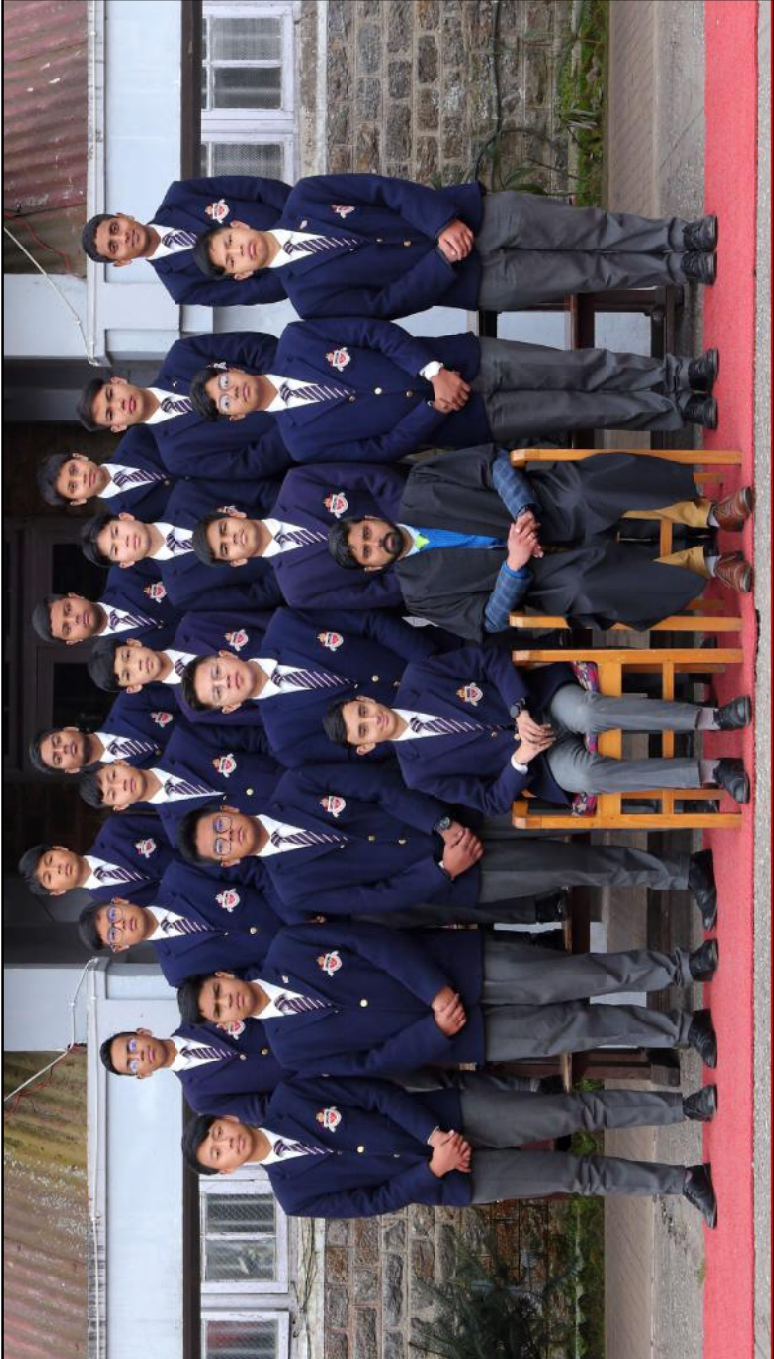
French Society, 2022