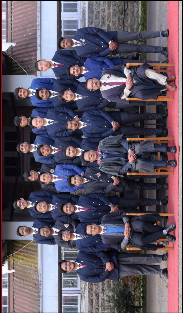
The ISC-2023 Candidates