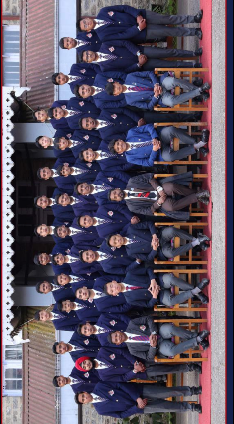
Art Club, 2022