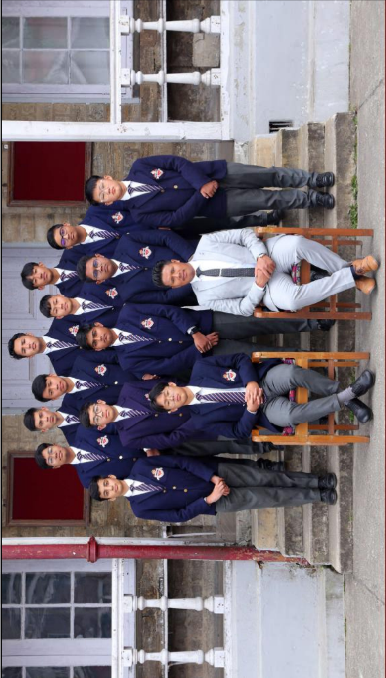
ICSE Volleyball Team, 2022