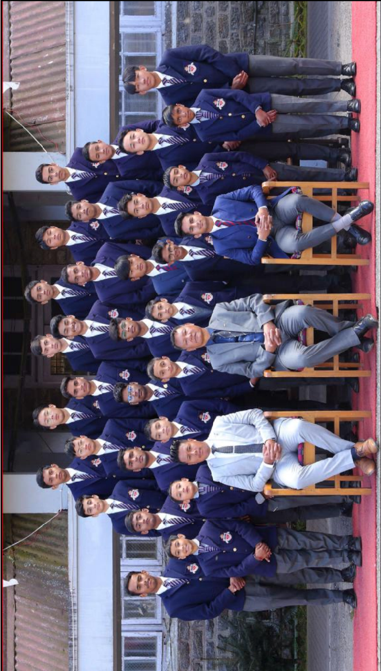
Athletics Team, 2022