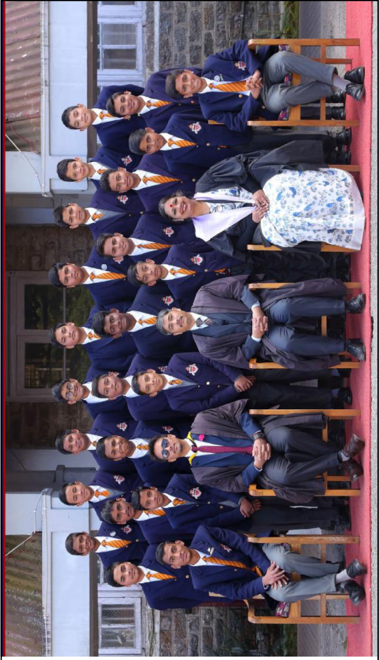
Betten House, 2022