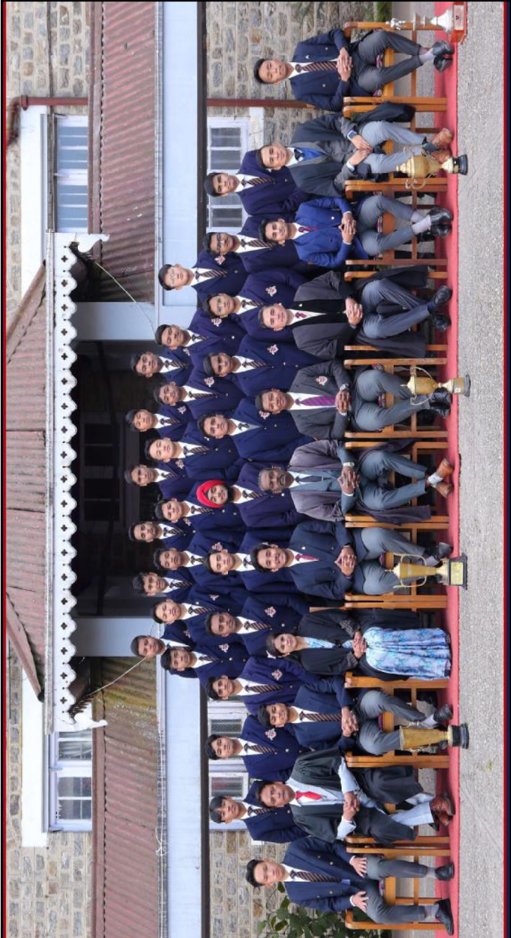
Lawrence House, 2022