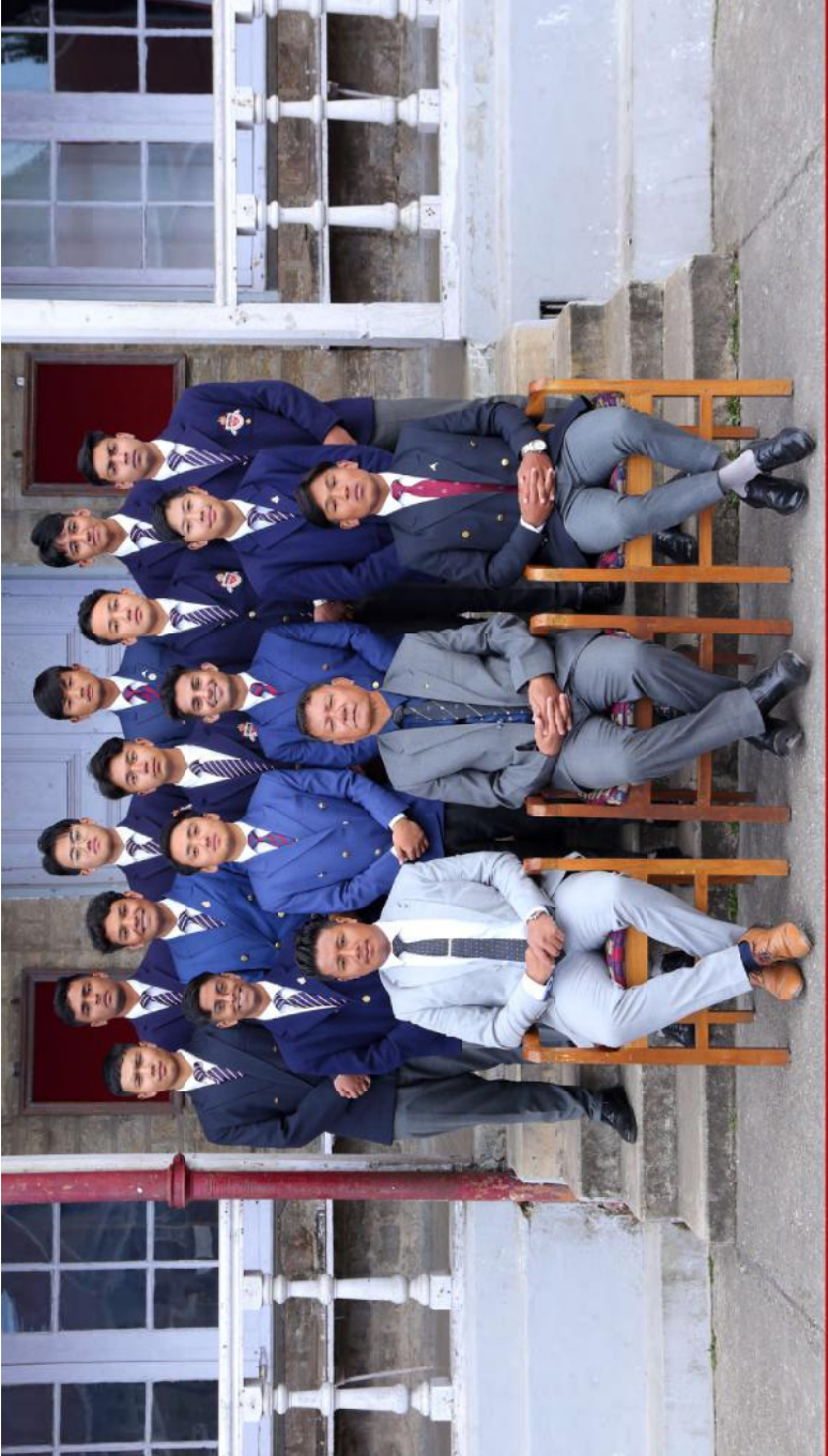
ISC Football Team, 2022