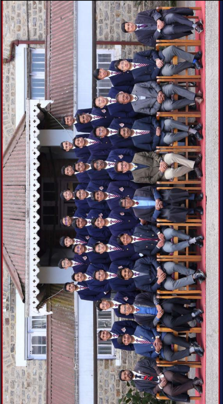
Hastings House, 2022