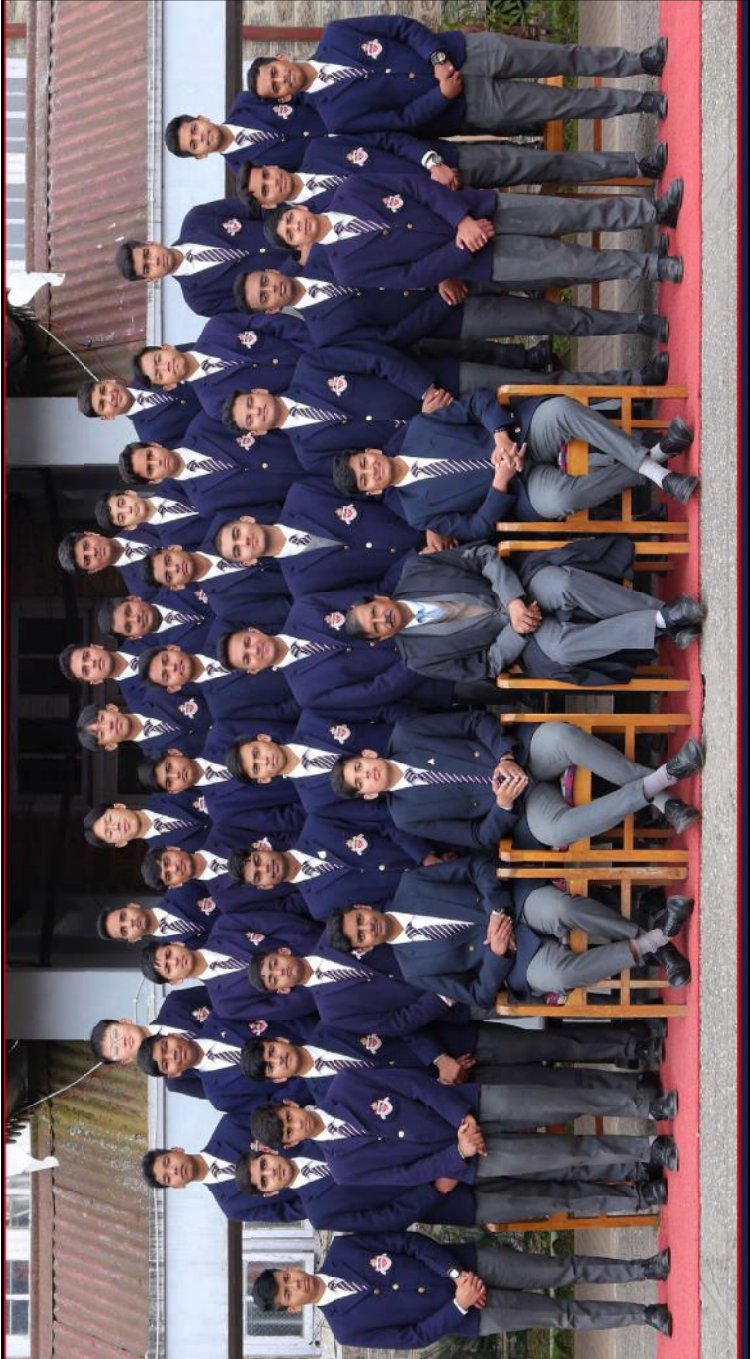
Hindi Parishad, 2022