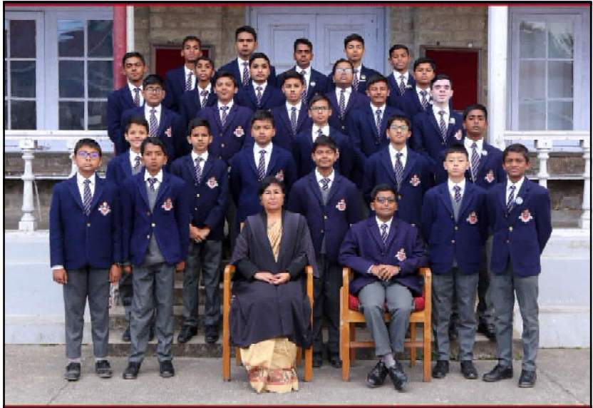
Junior Wing Debating Team