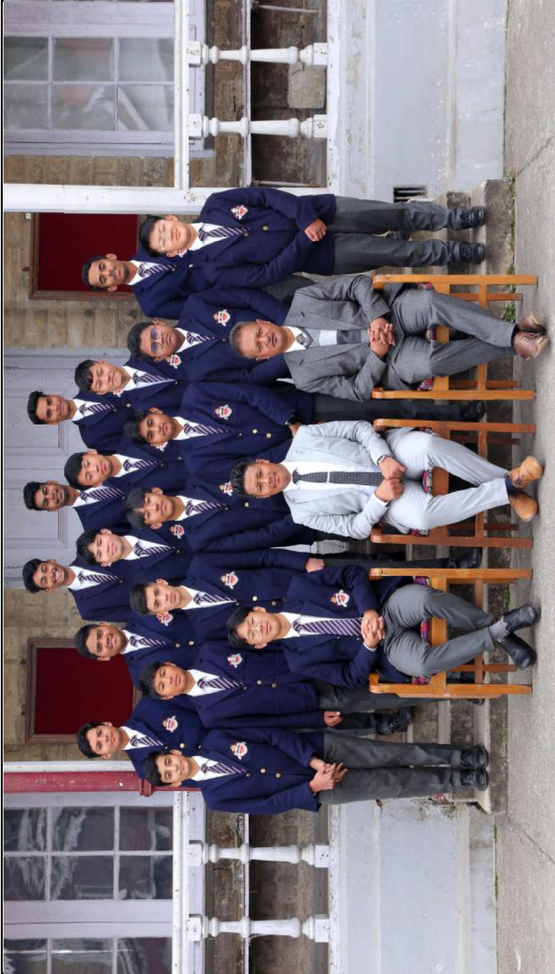
ICSE Football Team, 2022