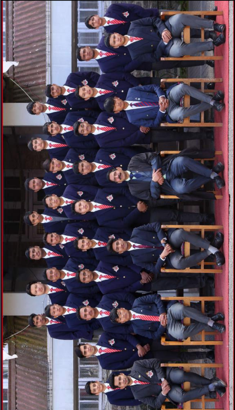
Clive House, 2022