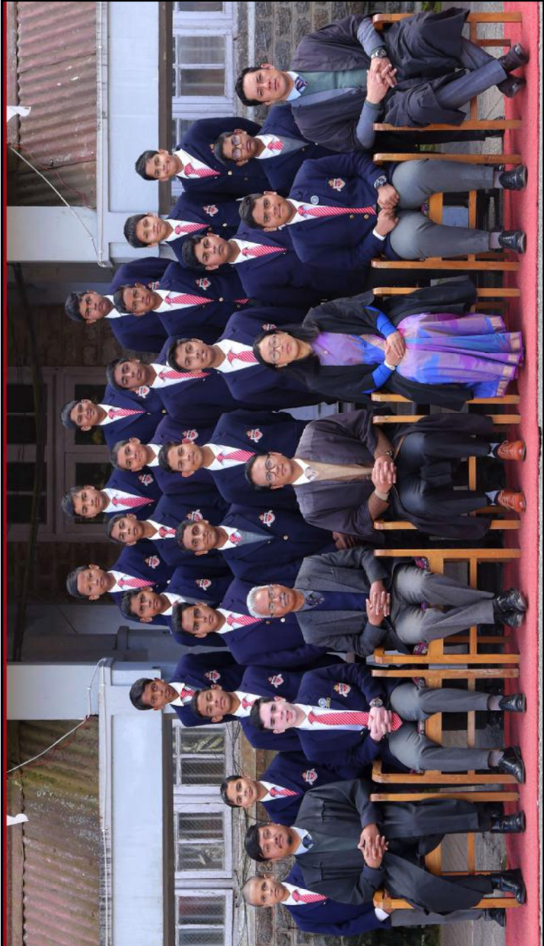
Anderson House, 2022