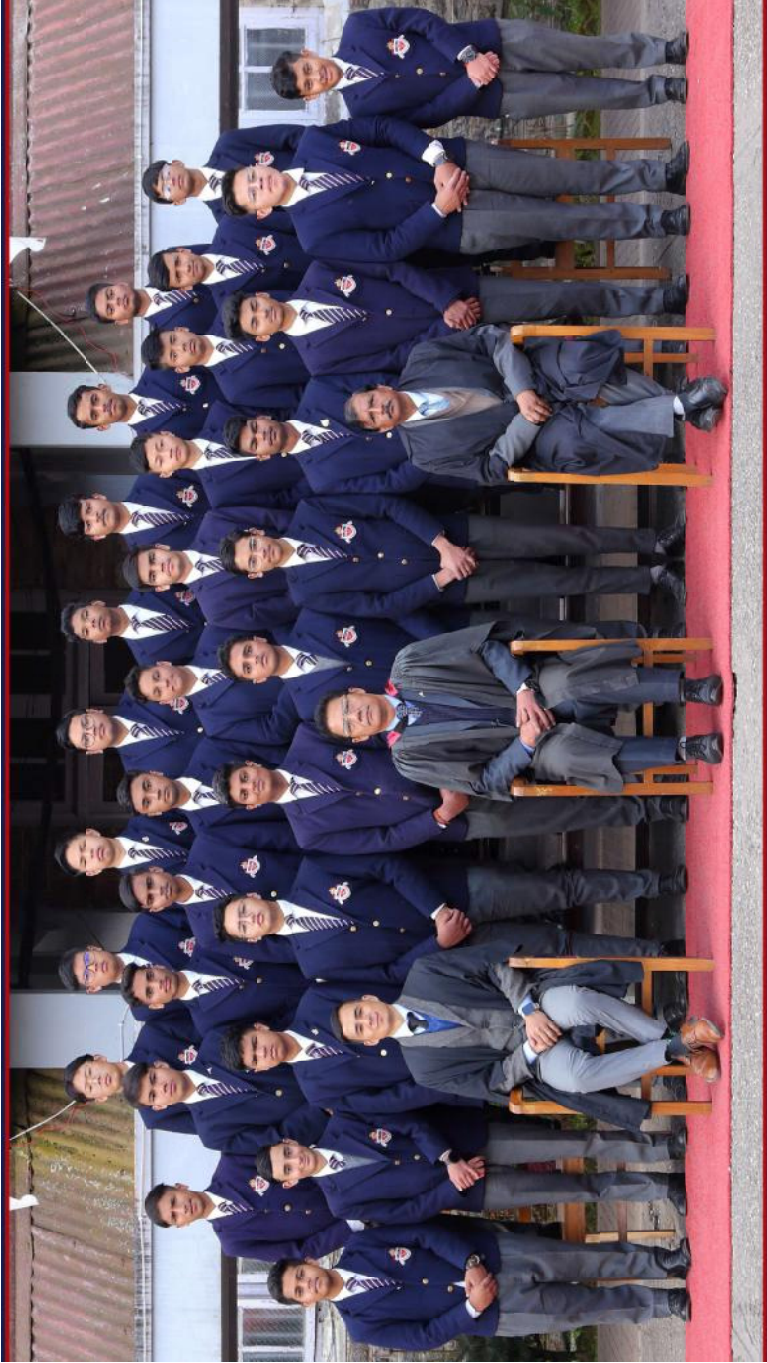
The ICSE 2023 Candidates