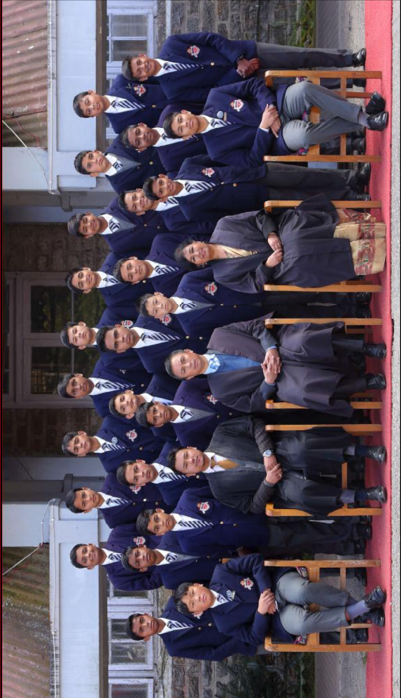
Westcott House, 2022