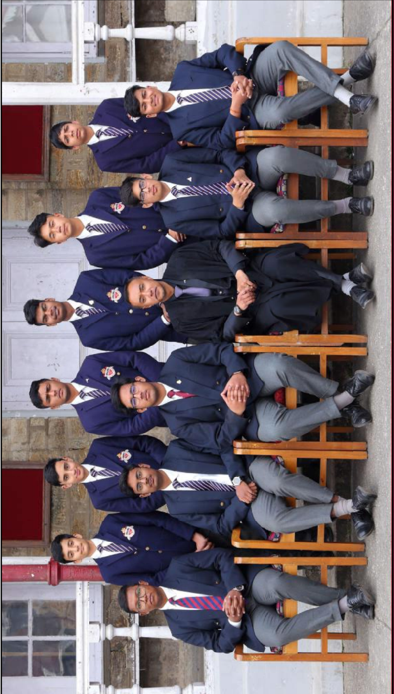
Photography Club, 2022