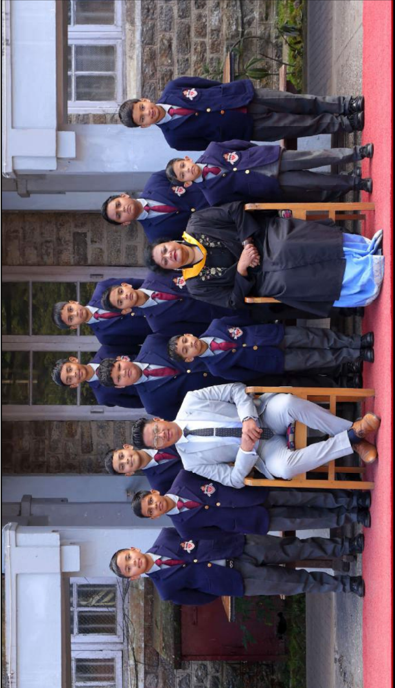
Hunt House, 2022