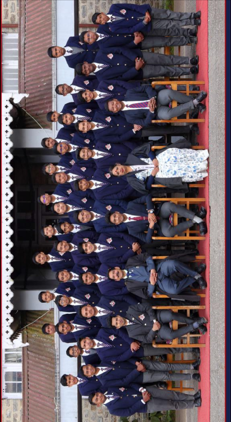
Bengali Society, 2022