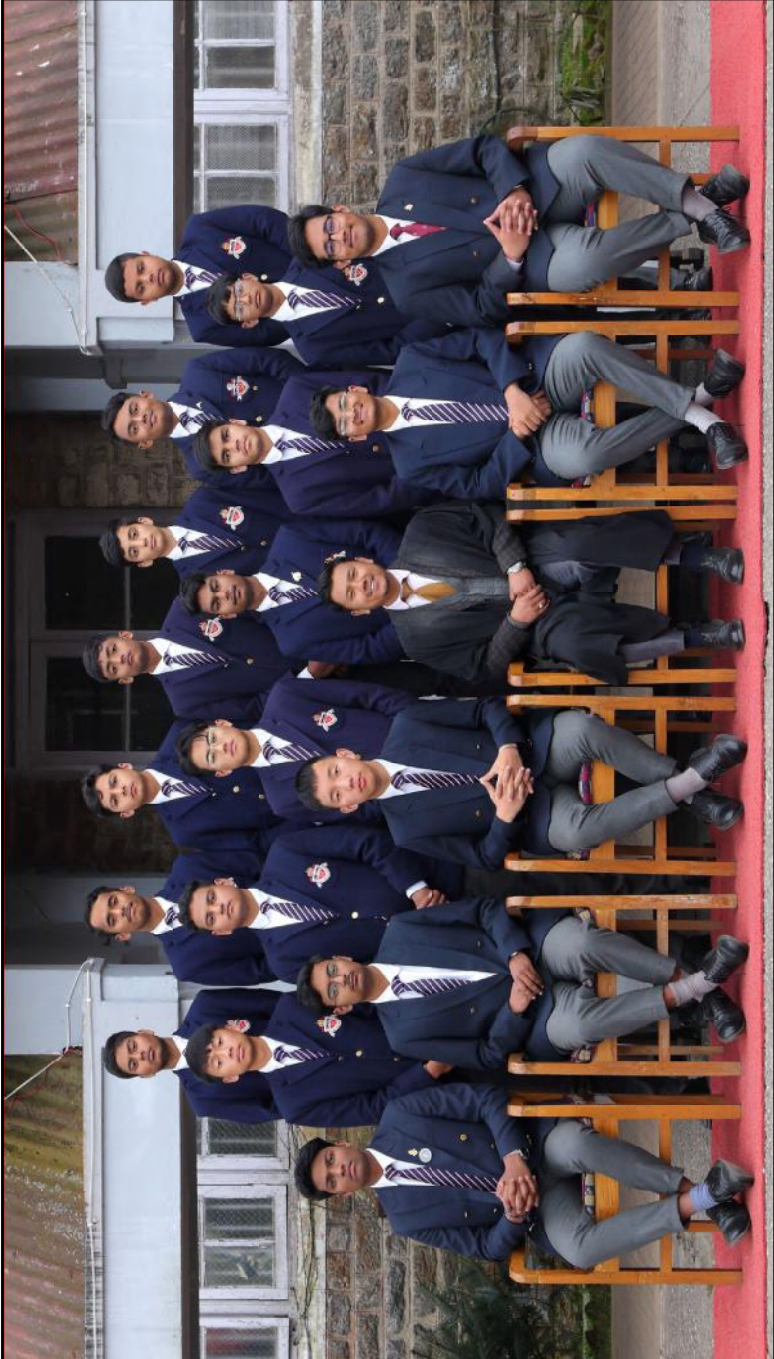
Senior Wing Debating Team, 2022