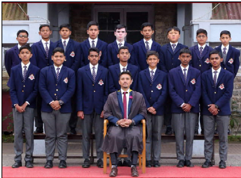
Junior Wing Cricket Team