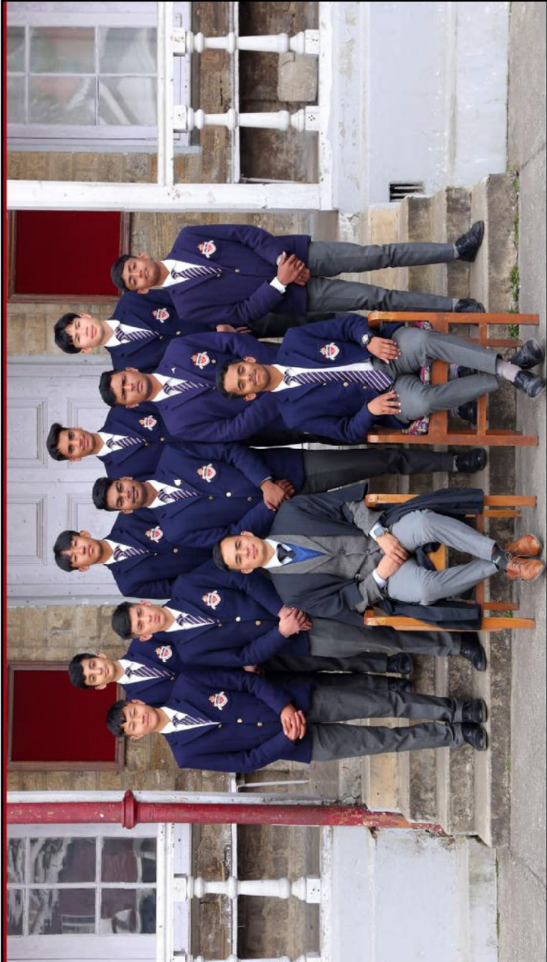
Marathon Winners, 2022