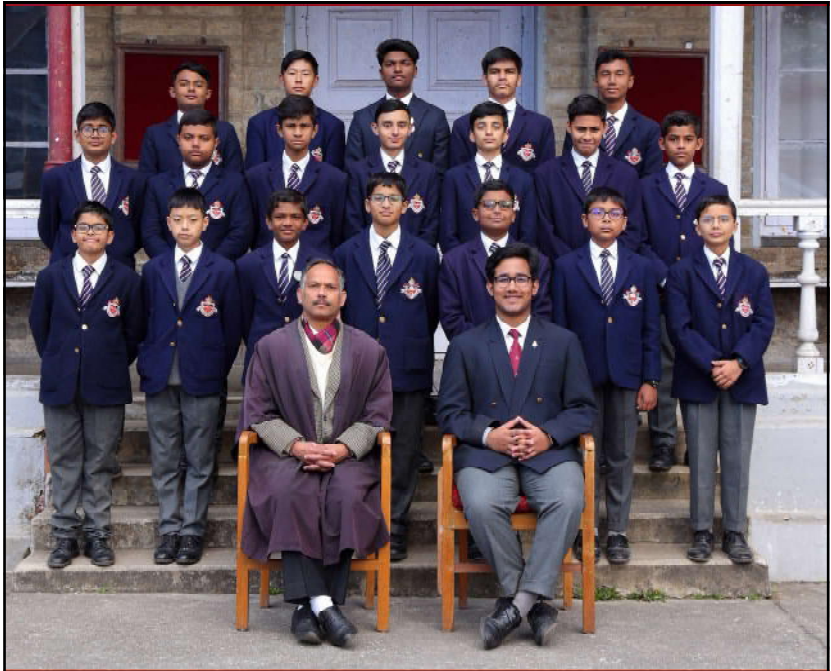
English Elocution Team, 2022