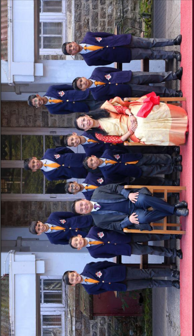
Everest House, 2022