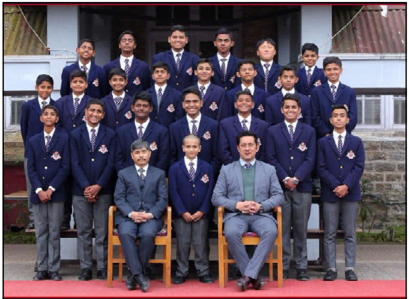
Junior Wing Racquet Games Enthusi-